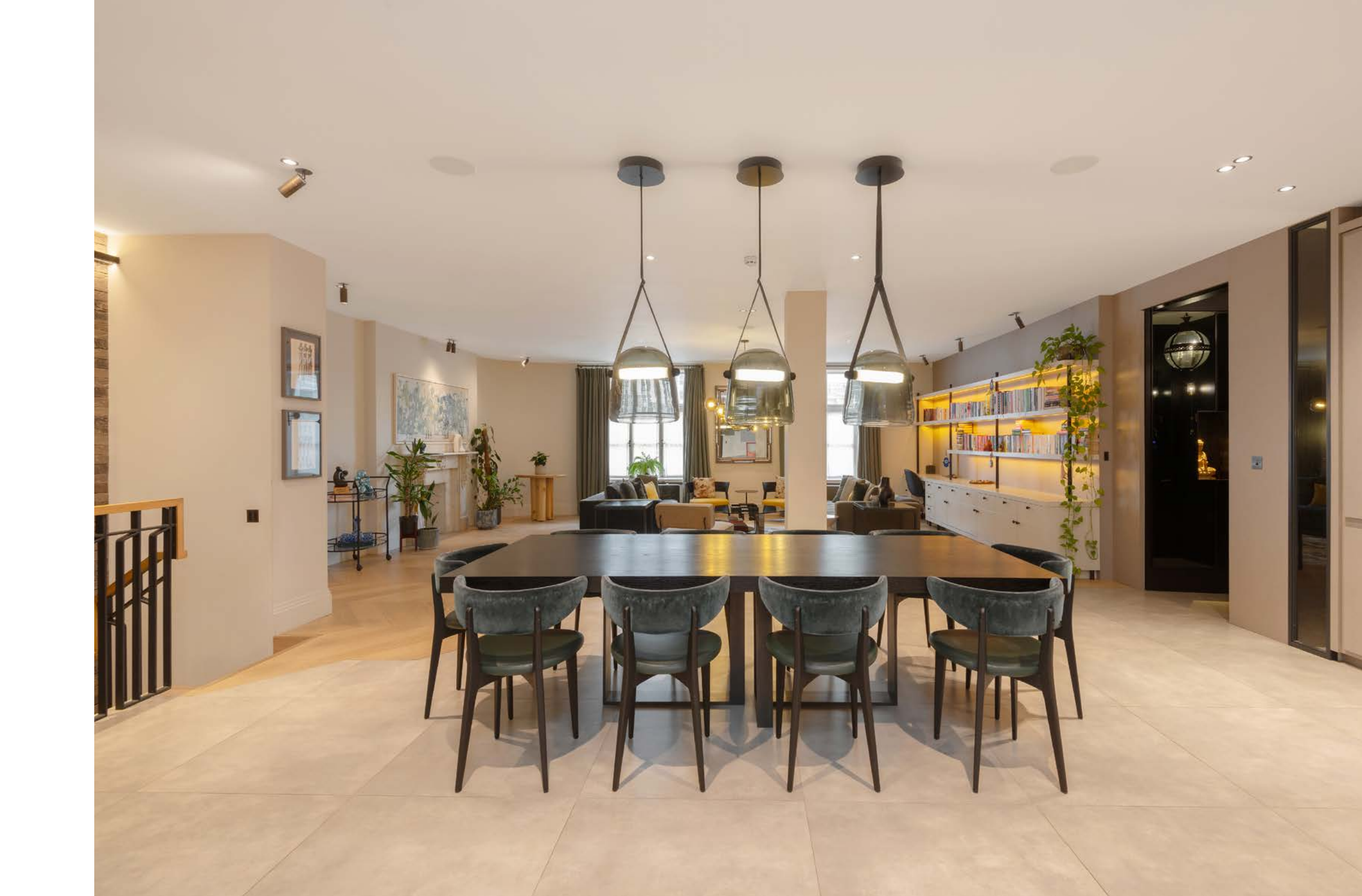
3,331 sq ft