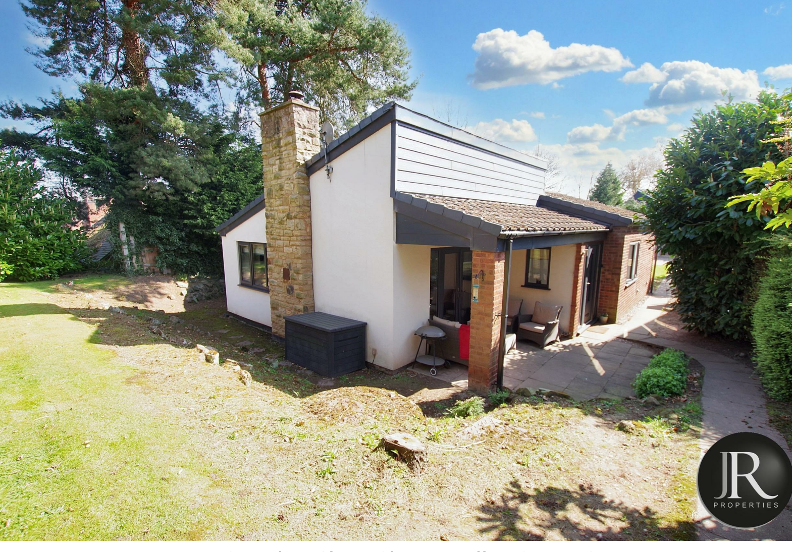
12 St. Johns Close, Slitting Mill, WS15 2TG Guide Price £470,000