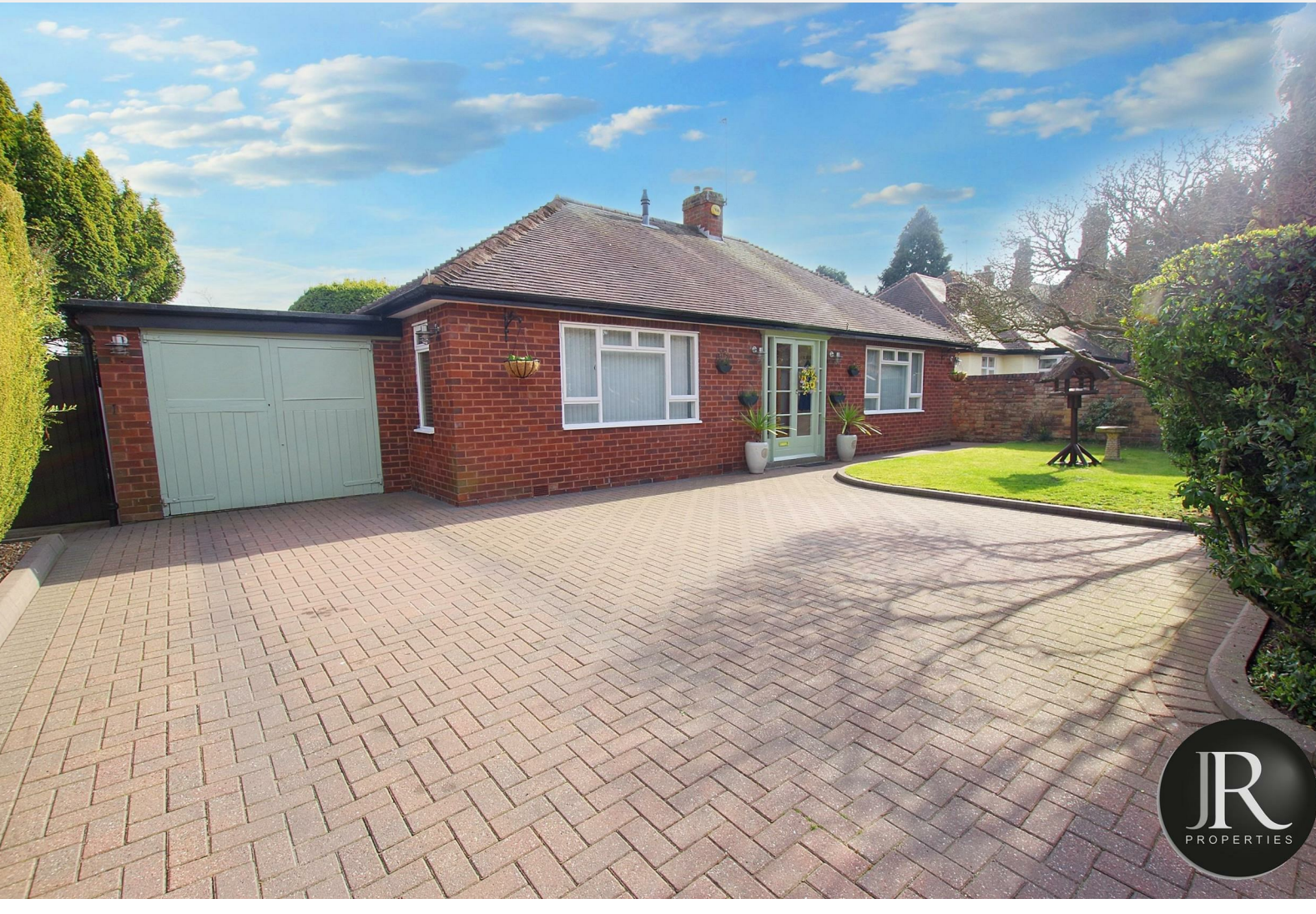
Elstead Church Street, Rugeley, WS15 2AB Guide Price £400,000