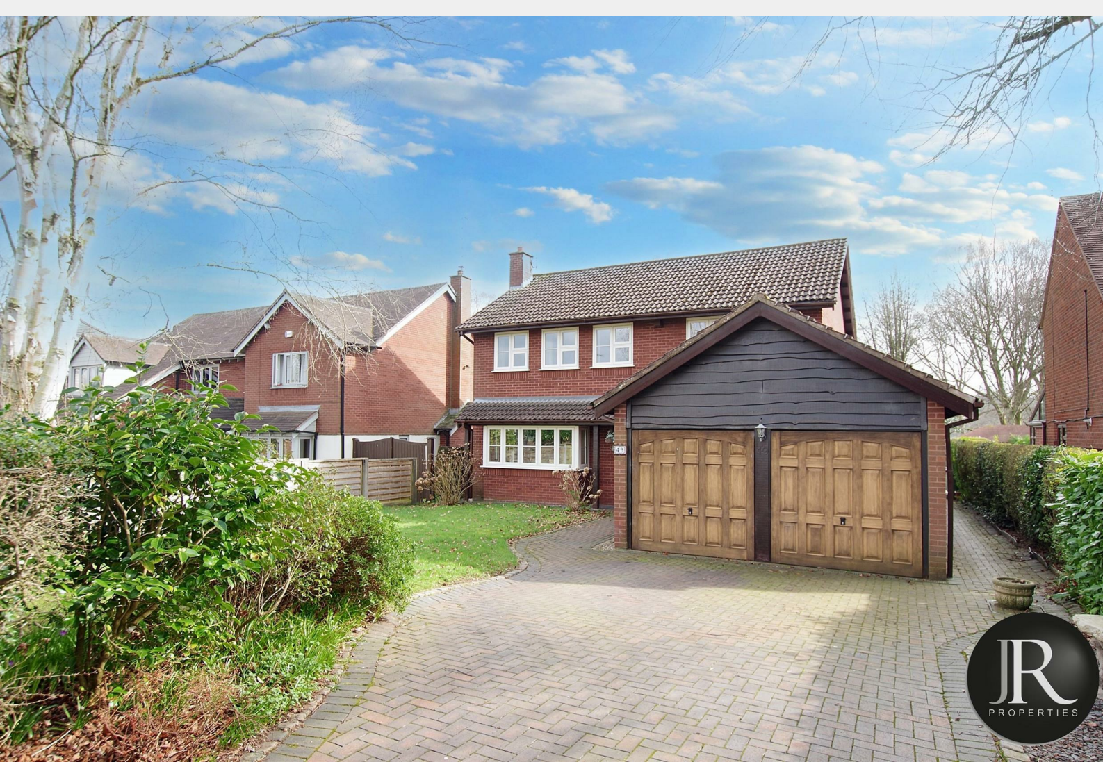
49 Stonehouse Road, Rugeley, WS15 2LL Guide Price £650,000