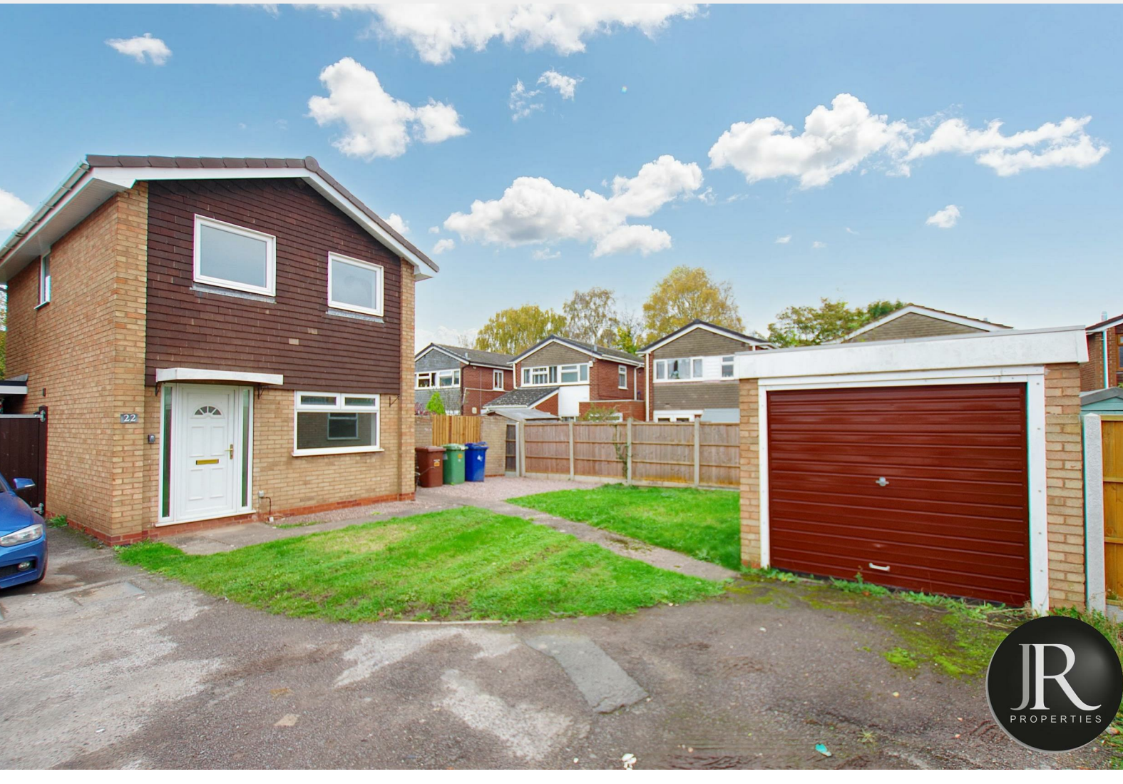
22 Watson Close, Rugeley, WS15 2PE Guide Price £200,000