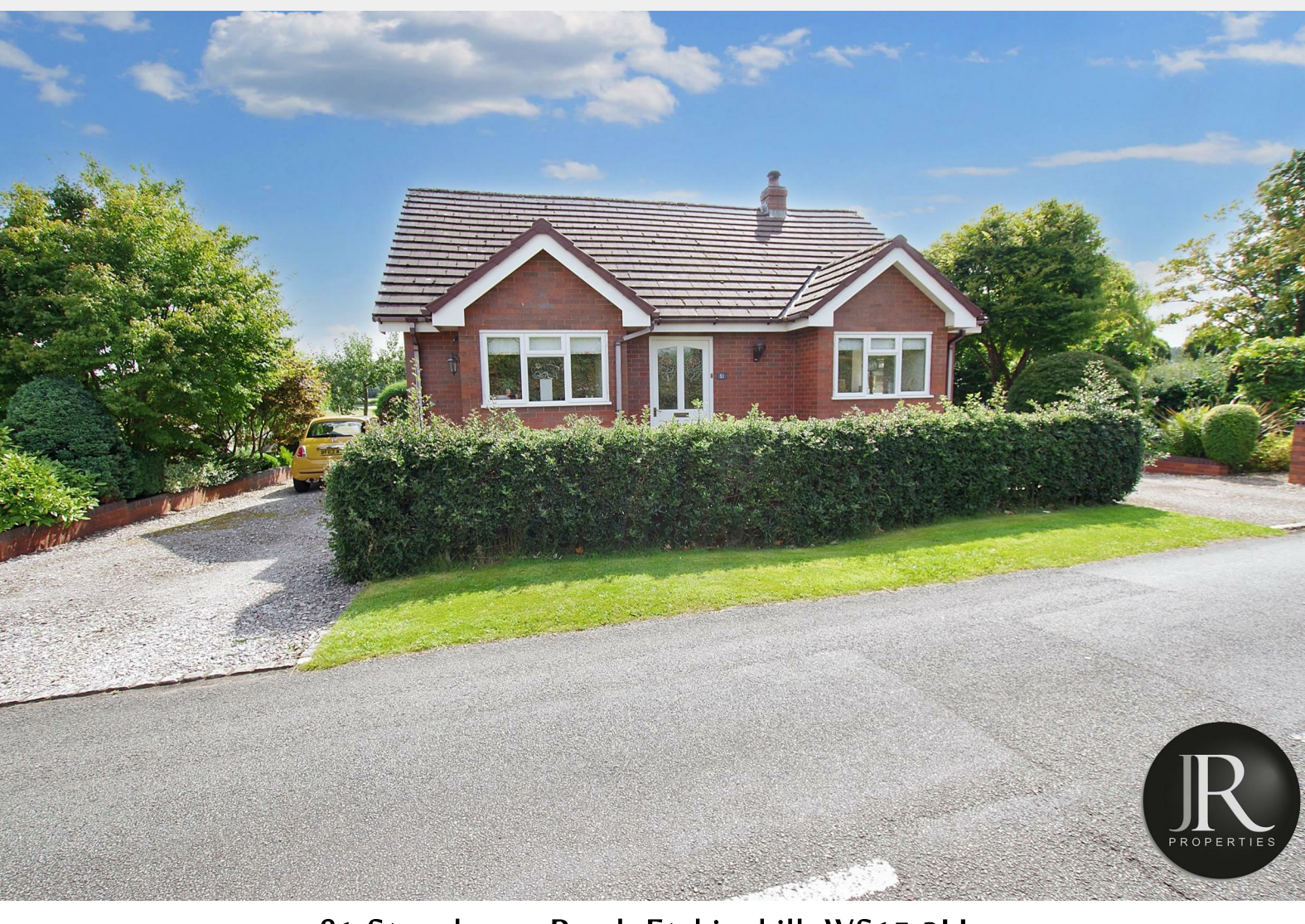
81 Stonehouse Road, Etchinghill, WS15 2LL Guide Price £469,950