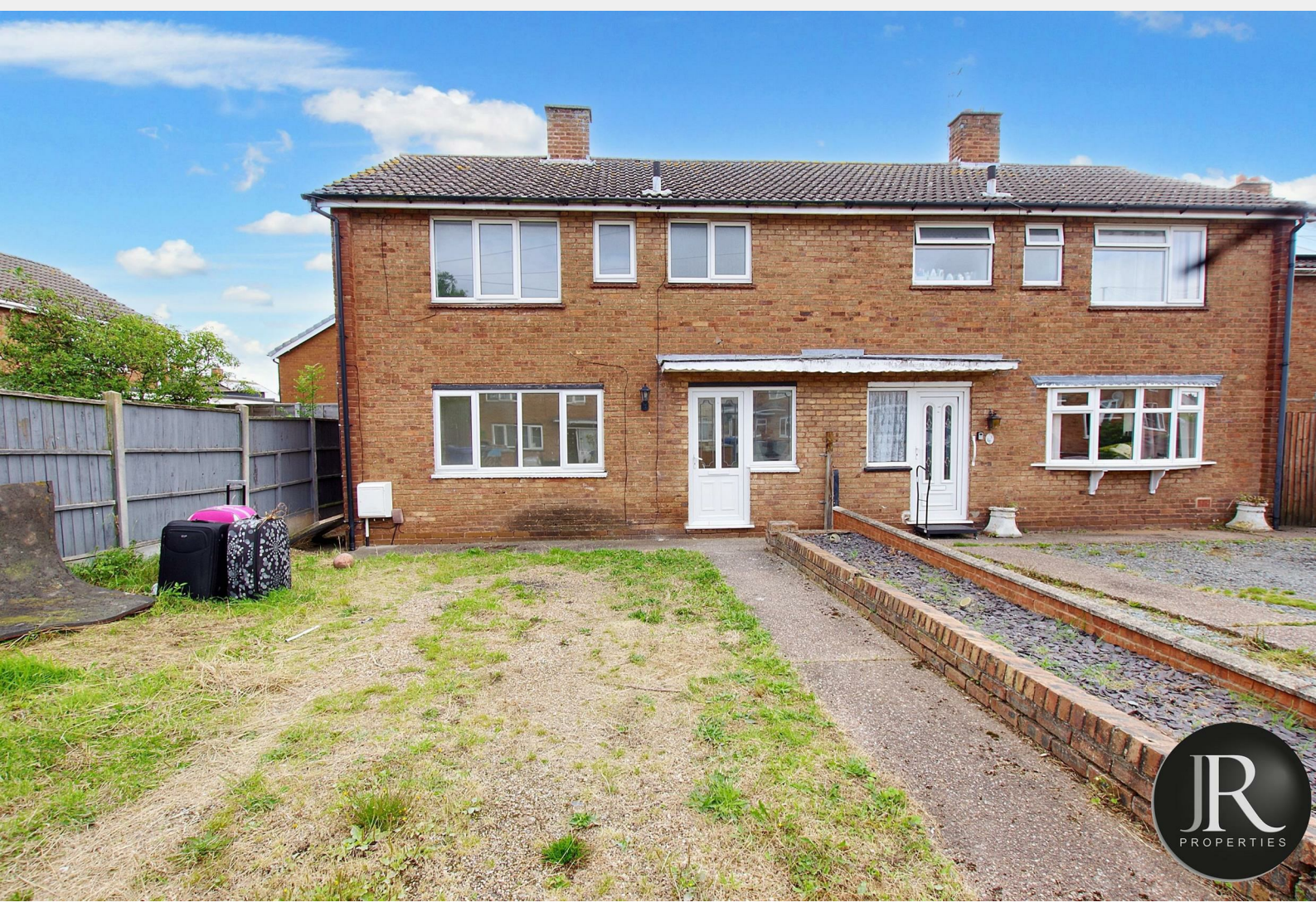
1 Bridge Road, Handsacre, WS15 4HQ Guide Price £179,950