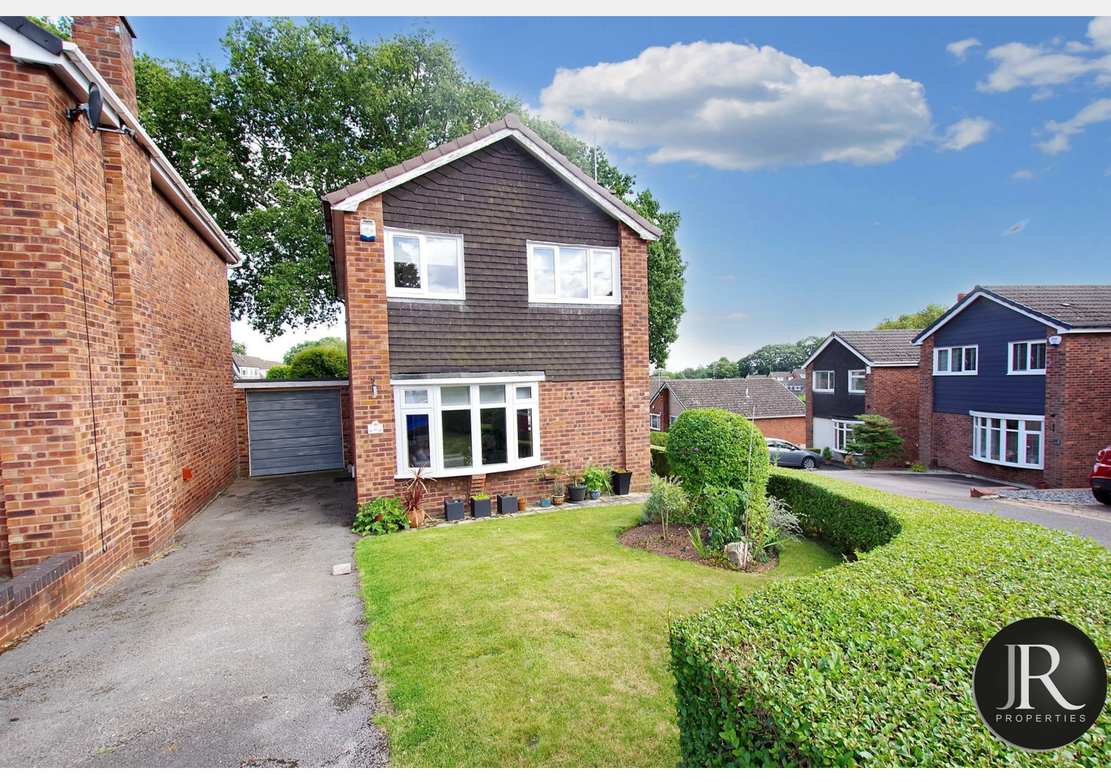
6 Crestwood Rise, Rugeley, WS15 2XZ Guide Price £299,950