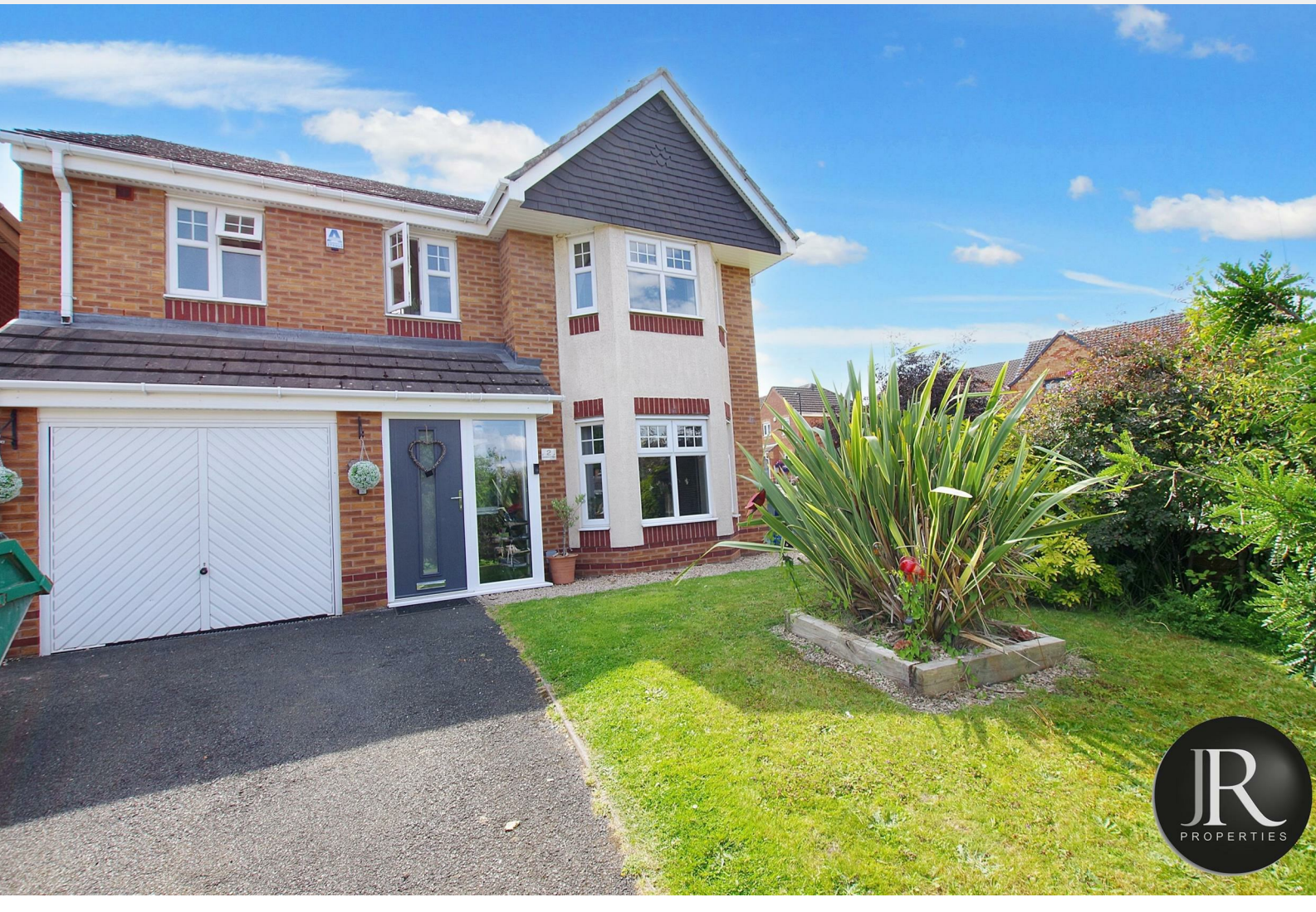
2 Hereford Way, Rugeley, WS15 1GP Guide Price £379,950