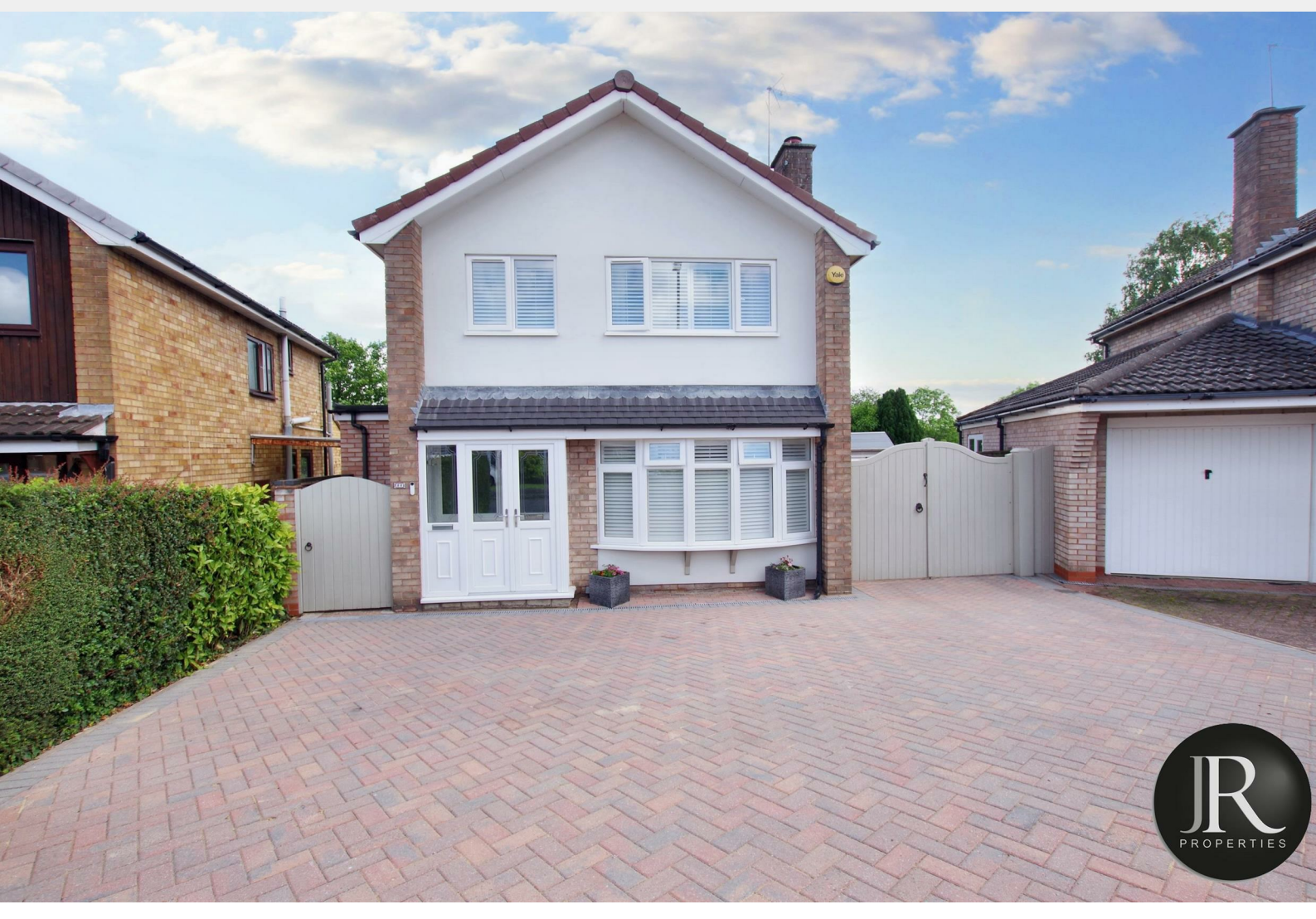
88 Old Eaton Road, Rugeley, WS15 2HA Guide Price £389,950