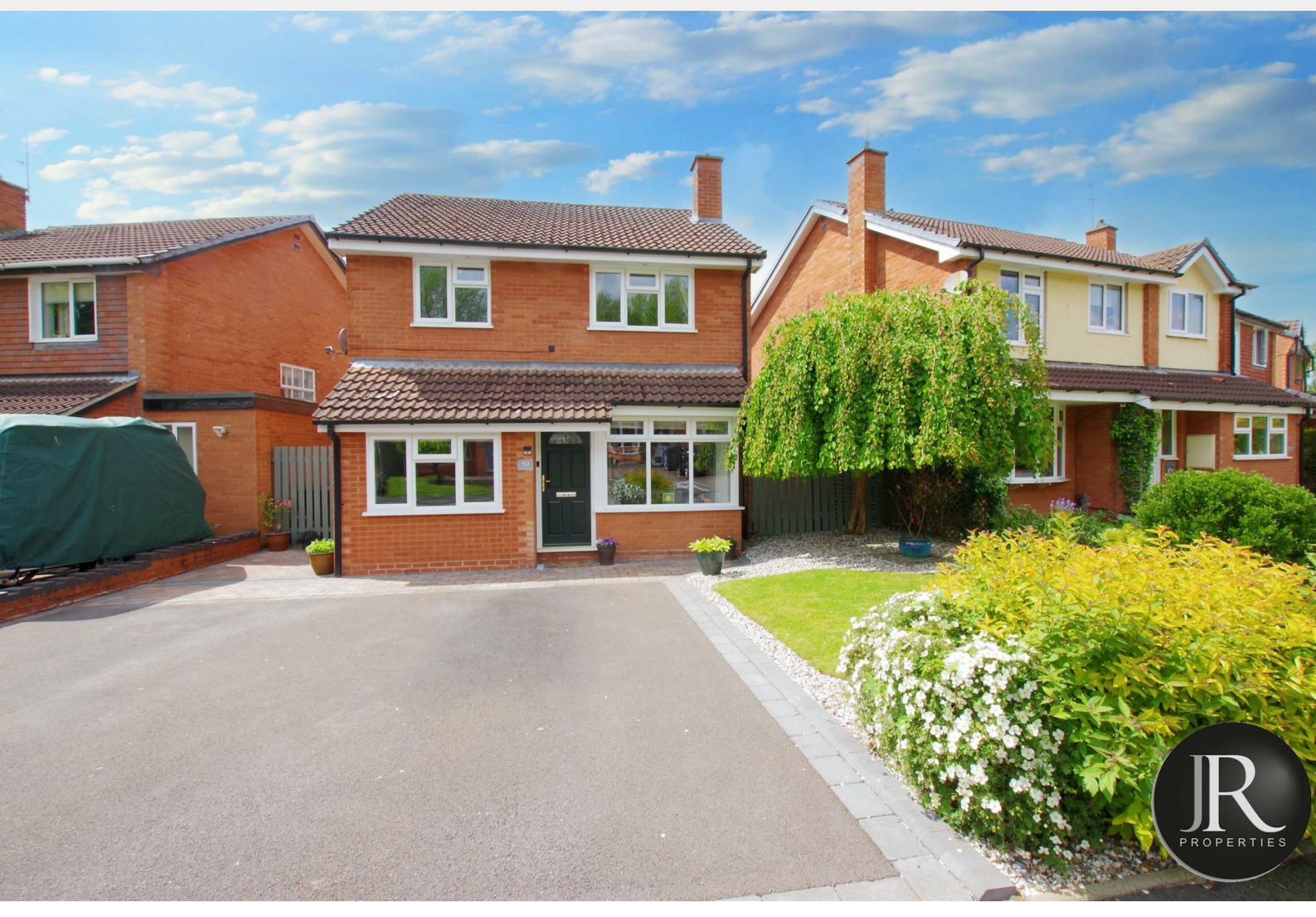
50 St. Marys Road, Little Haywood, ST18 0NJ Guide Price £325,000