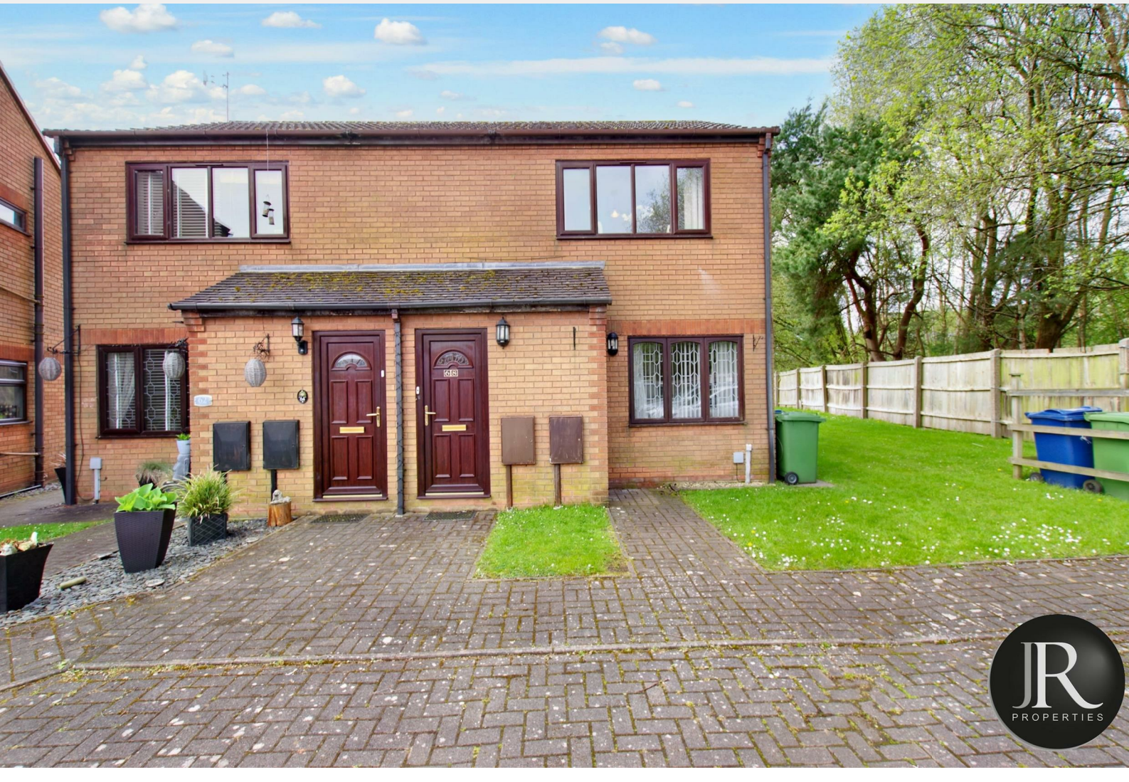
68 Greenslade Grove, Hednesford, WS12 1QR Guide Price £95,000