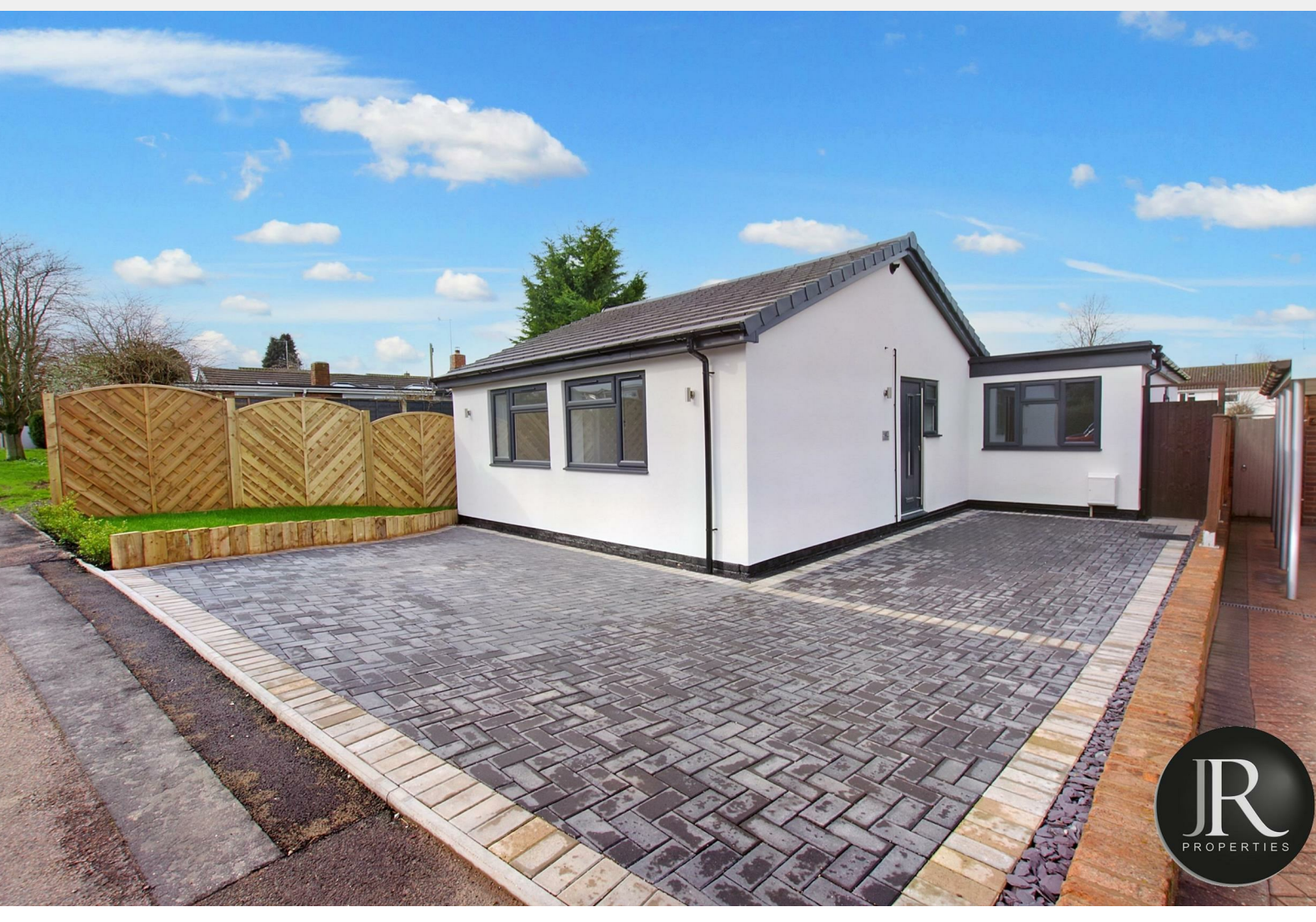
42 Essex Drive, Rugeley, WS15 1JX Guide Price £325,000