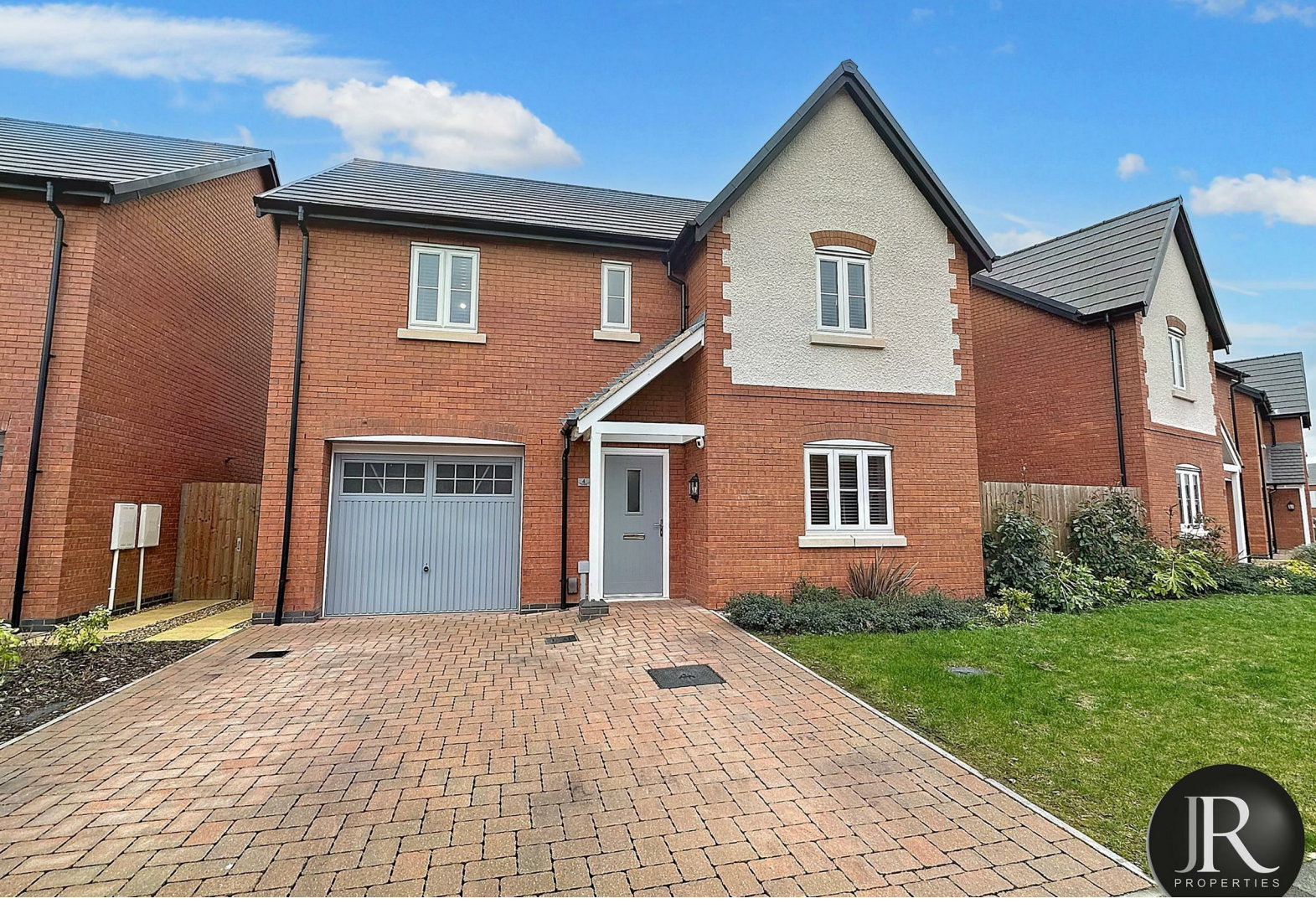
4 Fairfields, Burton Upon Trent, DE14 3PE Guide Price £350,000