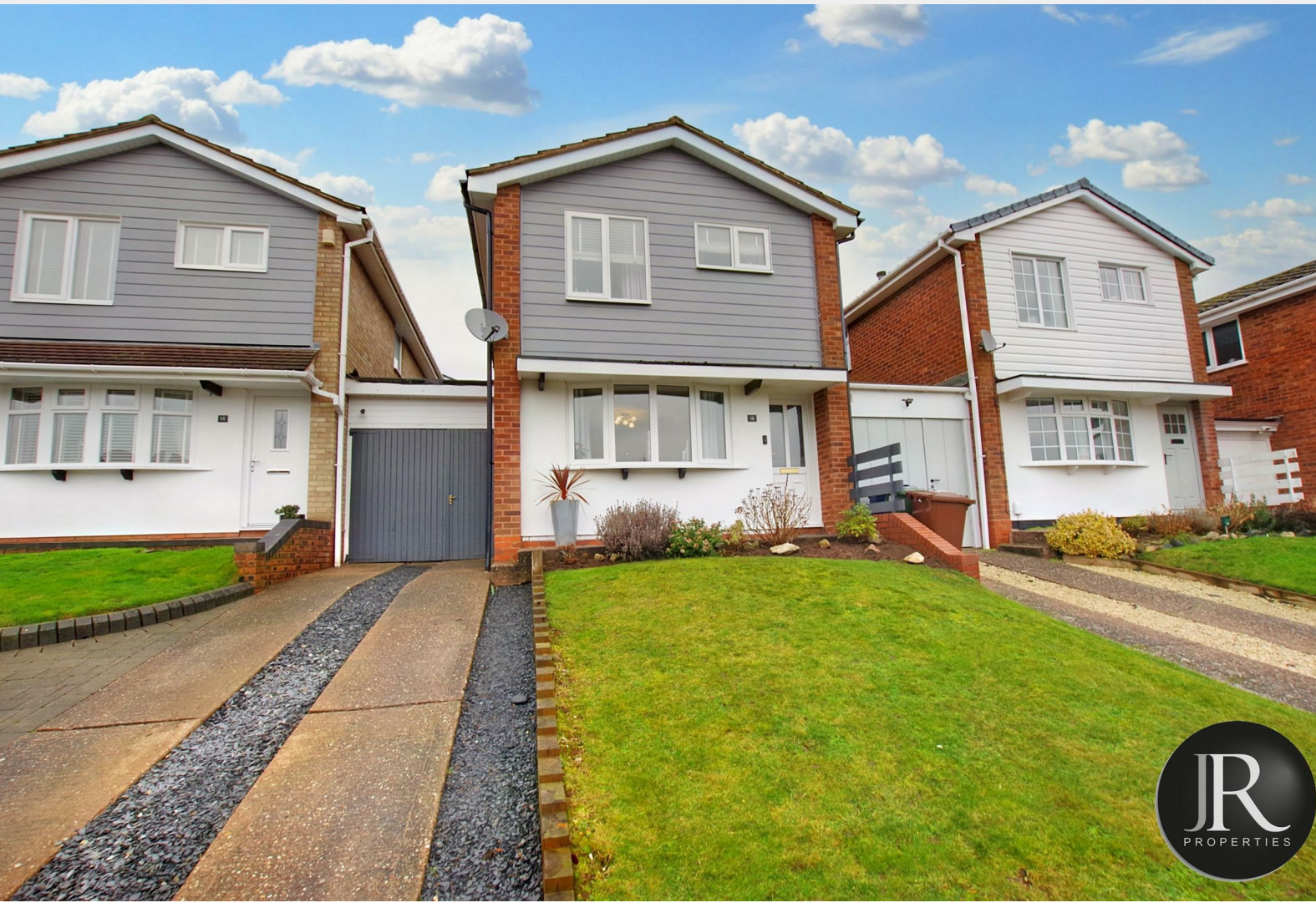
16 Sheringham Drive, Rugeley, WS15 2YG Guide Price £259,950