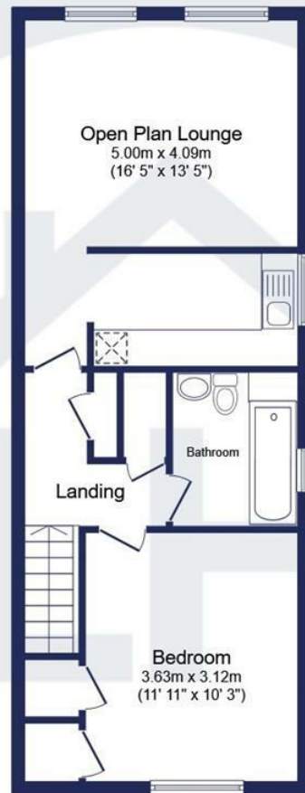
Floor Plan Floor area 44.9 sq.m. (483 sq.ft.)

Total floor area: 44.9 sq.m. (483 sq.ft.)