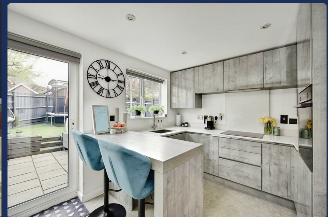
Charlock Drive, Minster On Sea, Sheerness Guide Price £325,000