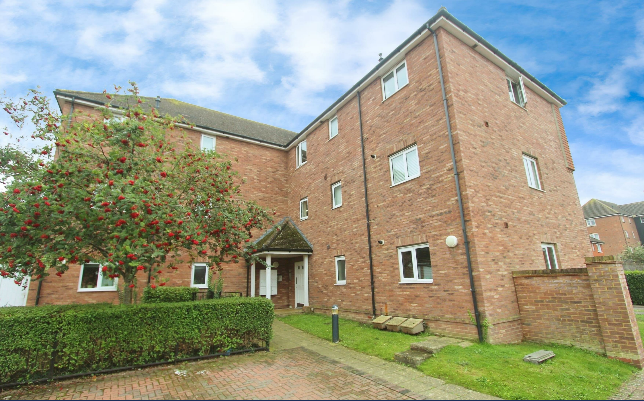
Limehouse Court, Sittingbourne