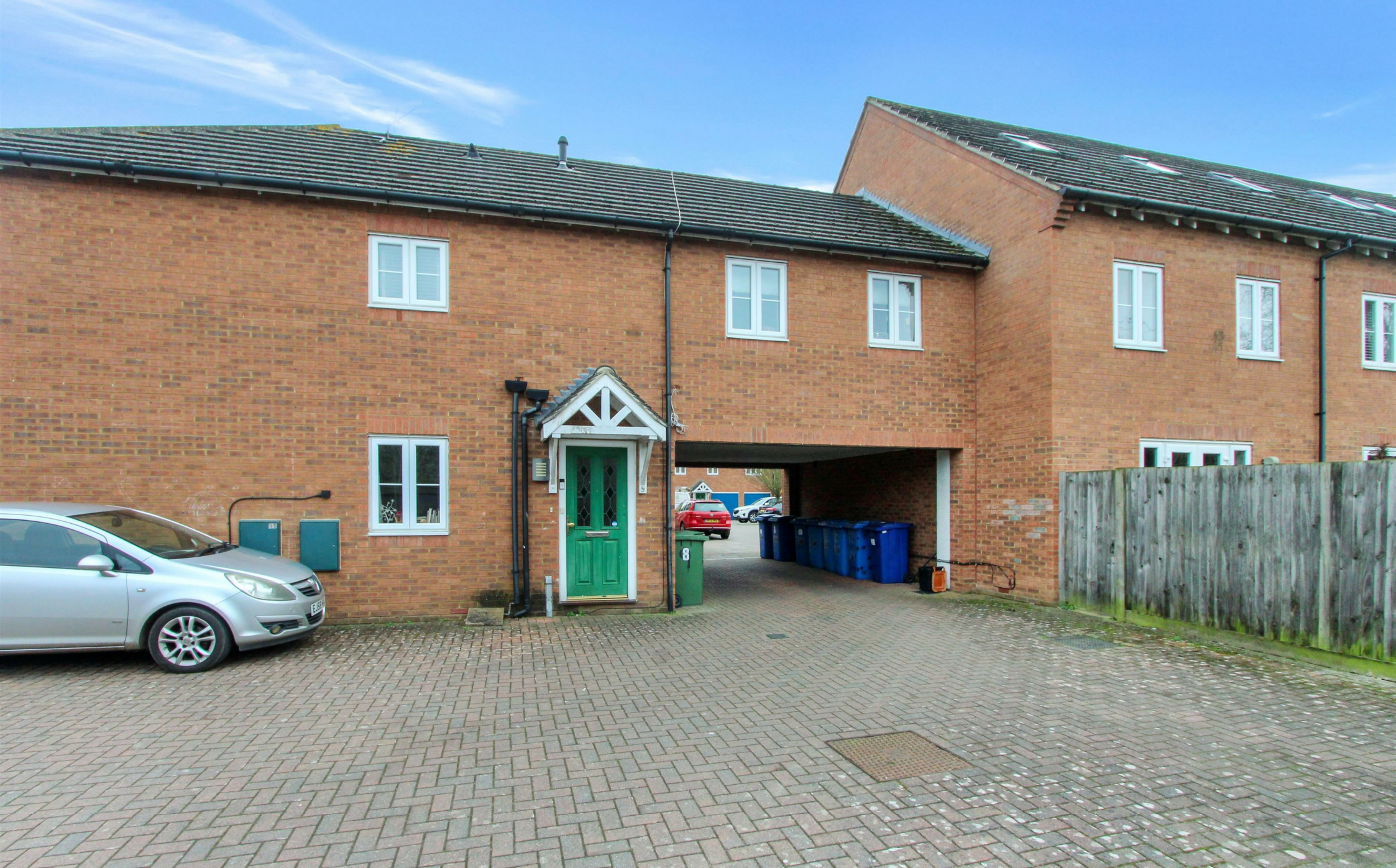
Archer Court, Kemsley, Sittingbourne