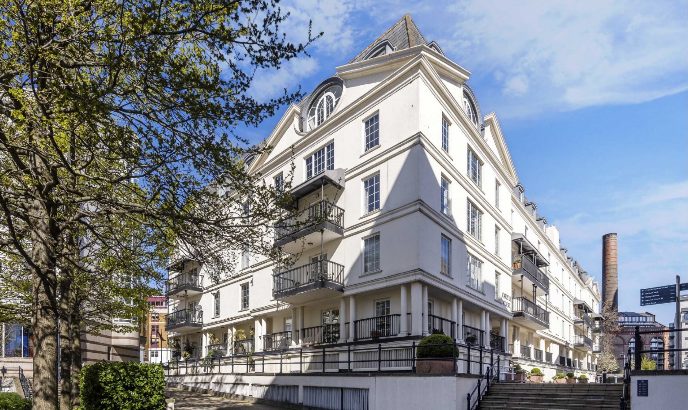
Carlyle Court, SW10 £999,950