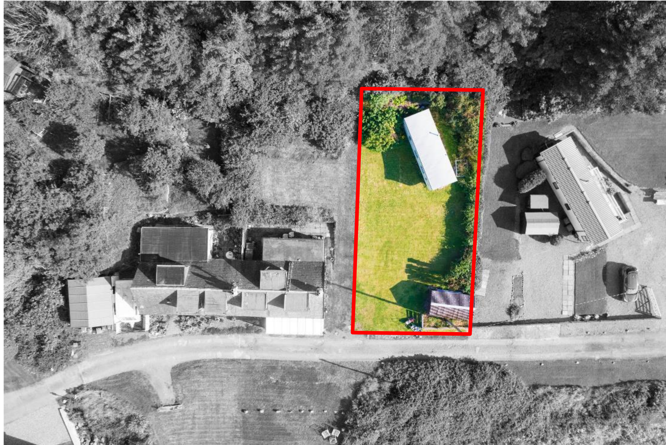
Left: Arial View of Plot Boundary