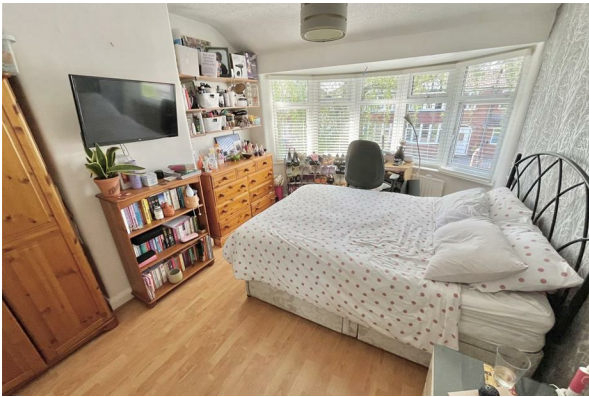
Bedroom Four, having a uPVC double glazed window to the rear elevation overlooking the Gardens.

The Family Bathroom is fitted with a contemporary white suite with chrome fittings comprising of panelled enamelled bath, separate shower cubicle with electric shower, WC and wash hand basin. Wall-mounted, heated, polished chrome towel rail radiator. Opaque, uPVC double glazed window to the rear elevation. Polished tiled floor. Tiled walls.