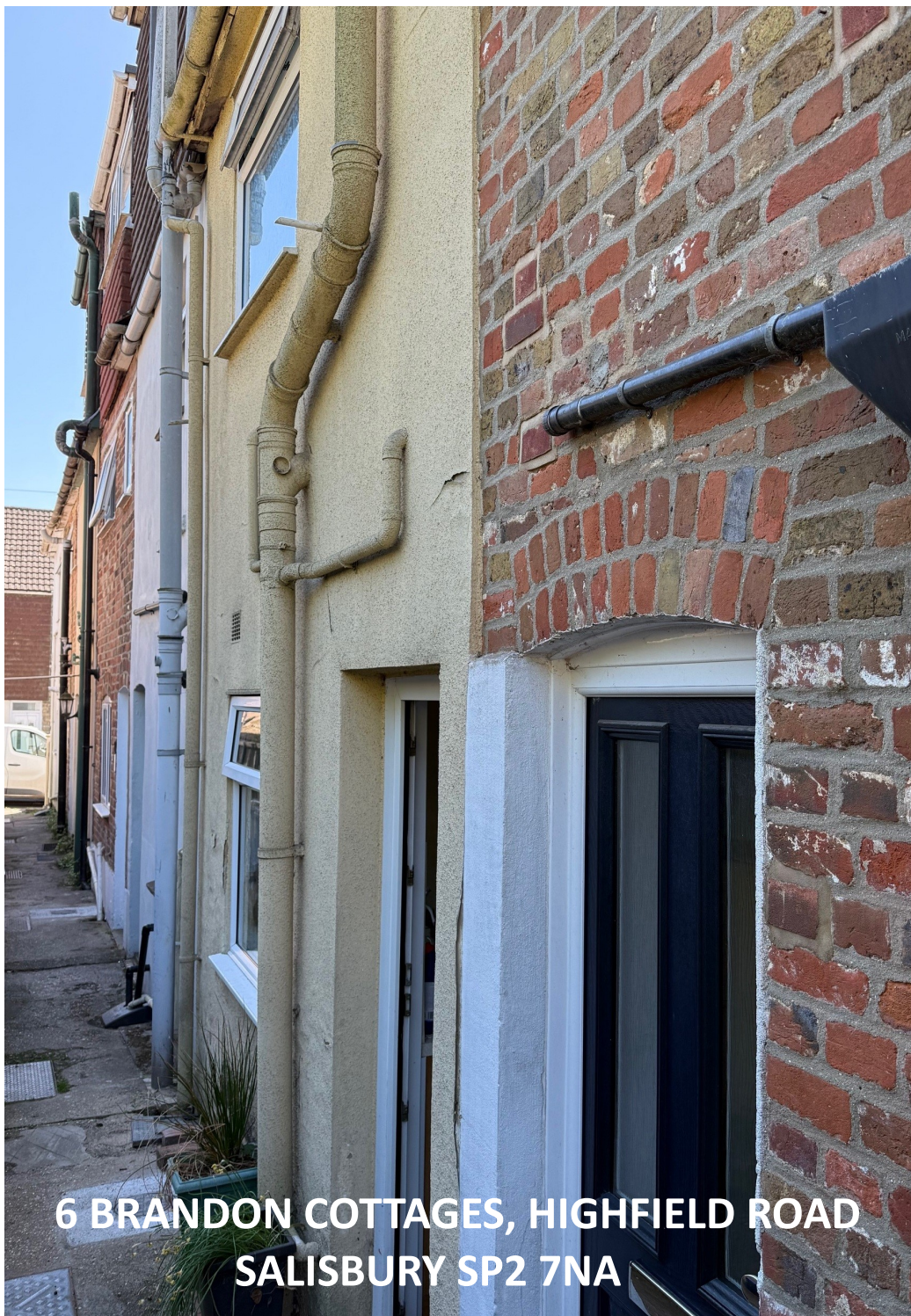
6 BRANDON COTTAGES, HIGHFIELD ROAD SALISBURY SP2 7NA