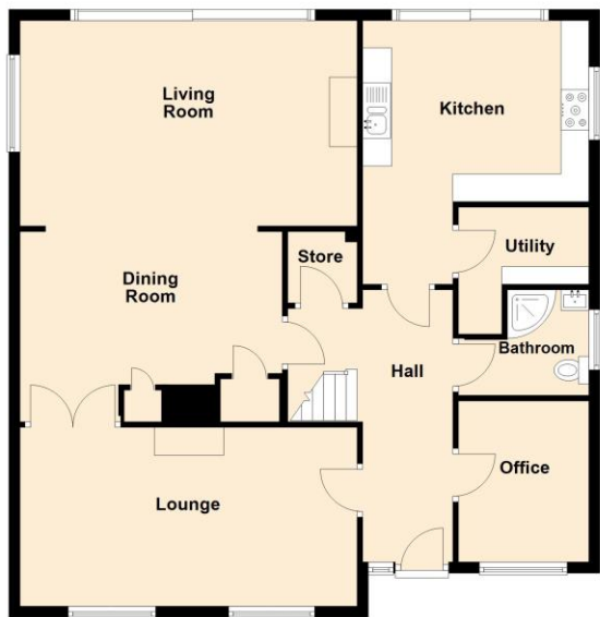
Ground Floor Approx. 104.7 sq. metres (1126.6 sq. feet)

To check broadband speeds and mobile coverage for this property please visit: https://www.ofcom.org.uk/phones-telecoms-and-internet/advice-for-consumers/advice/ofcom-checker and enter postcode WR10 3EL