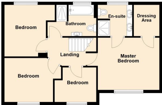
First Floor Approx. 62.4 sq. metres (671.2 sq. feet)

Total area: approx. 167.0 sq. metres (1797.7 sq. feet)