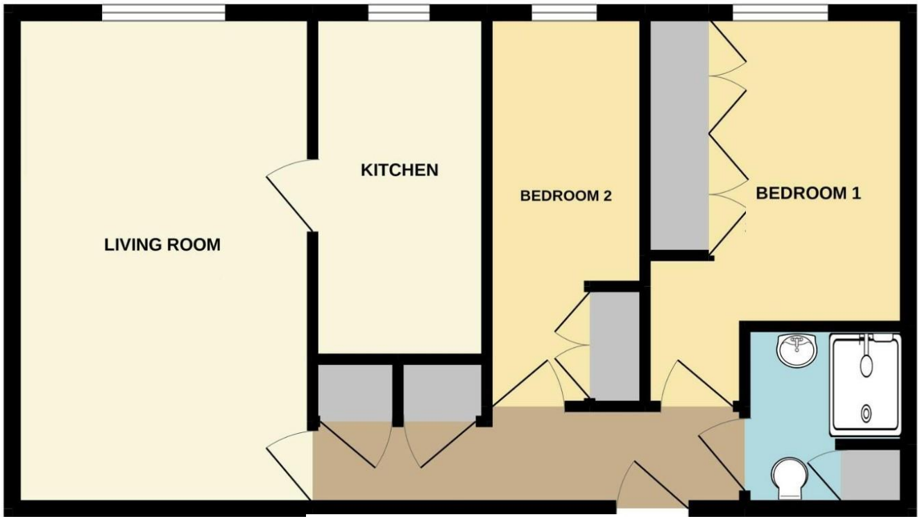
Approximate for reference only