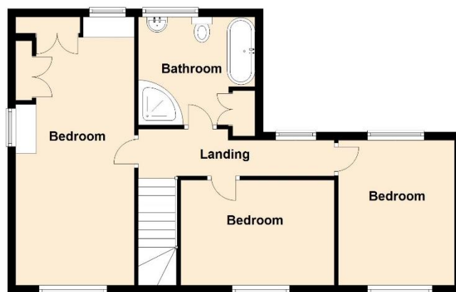
First Floor Approx. 56.0 sq. metres (602.8 sq. feet)

Total area: approx. 123.9 sq. metres (1333.8 sq. feet)