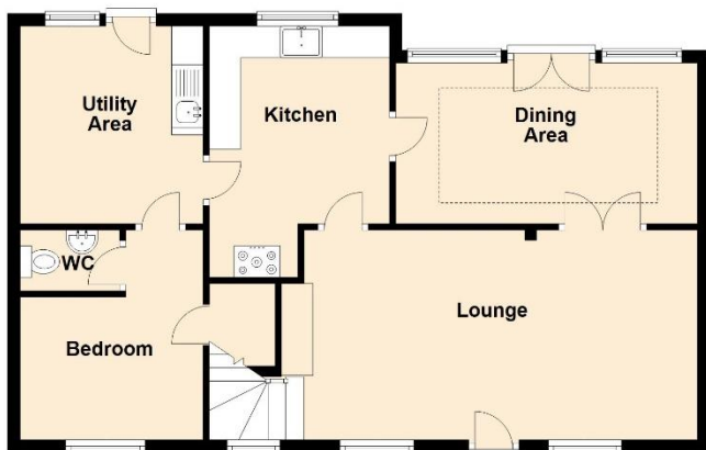
Ground Floor Approx. 67.9 sq. metres (731.0 sq. feet)