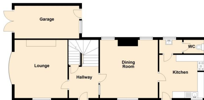
Ground Floor Approx. 78.9 sq. metres (827.3 sq. feet)