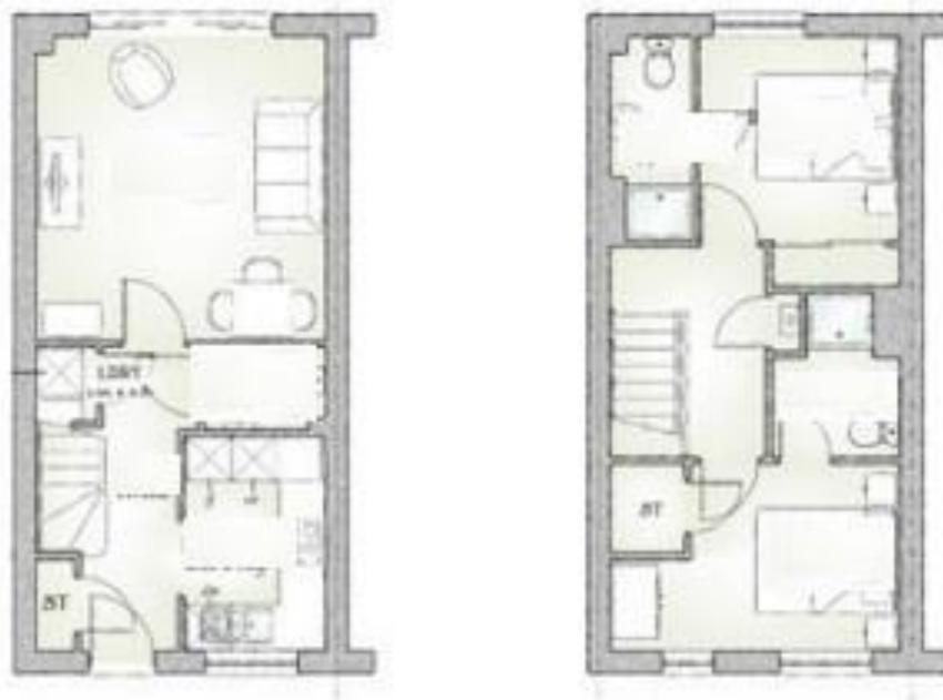
Approximate measurements for guidance only