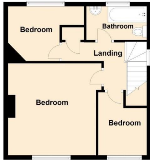
First Floor Approx. 38.8 sq. metres (418.1 sq. feet)

Total area: approx. 77.2 sq. metres (830.7 sq. feet)