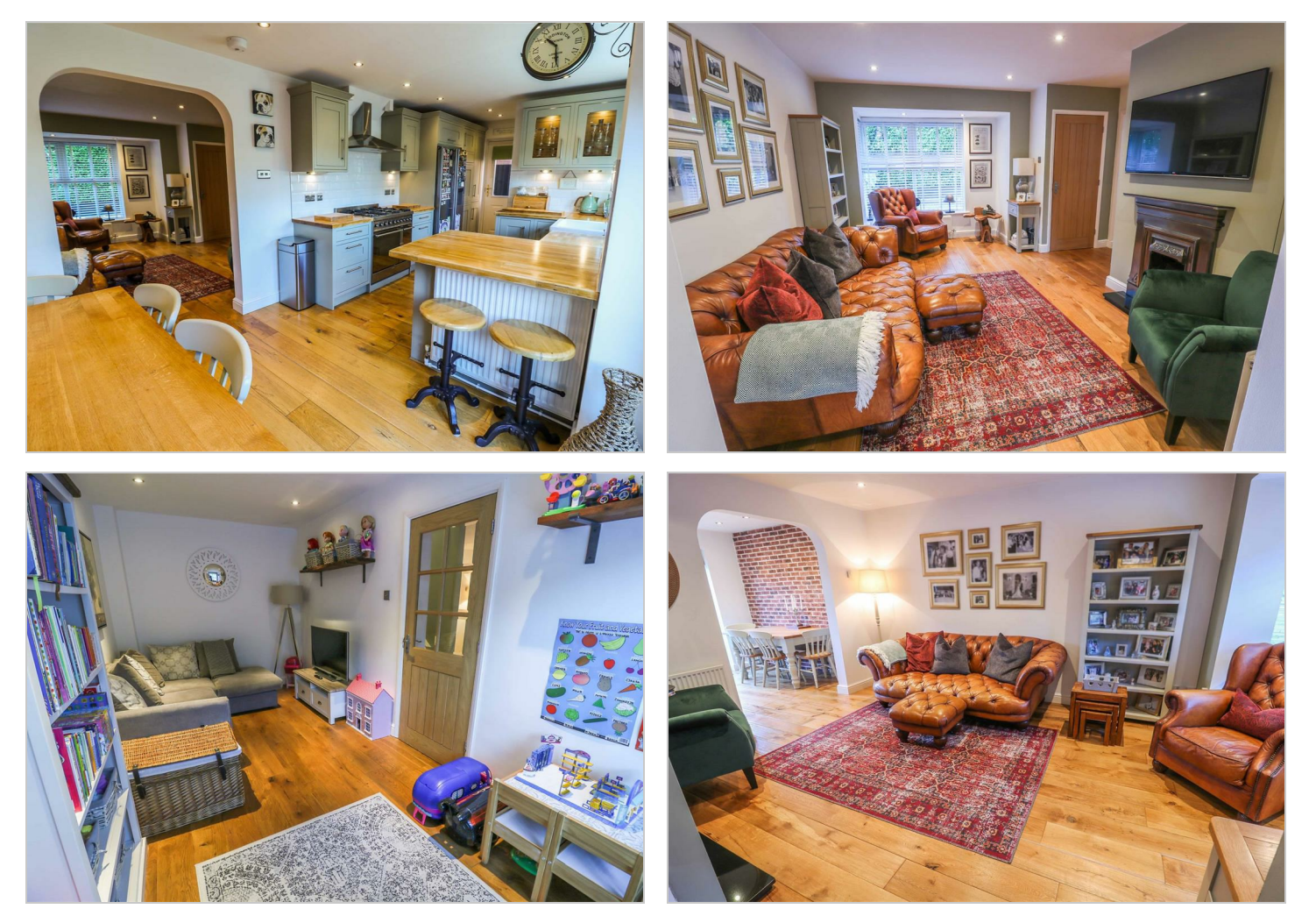
These particulars, whilst believed to be accurate are set out as a general outline only for guidance and do not constitute any part of an offer or contract. Intending purchasers should not rely on them as statements of representation of fact, but must satisfy themselves by inspection or otherwise as to their accuracy. No person in this firms employment has the authority to make or give any representation or warranty in respect of the property.