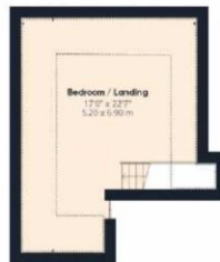
Floor 1 Building 1

Approximate total area (1) 1403.57 ft 2 130.4 m 2 Reduced headroom 537.46 ft 2 49.93 m 2