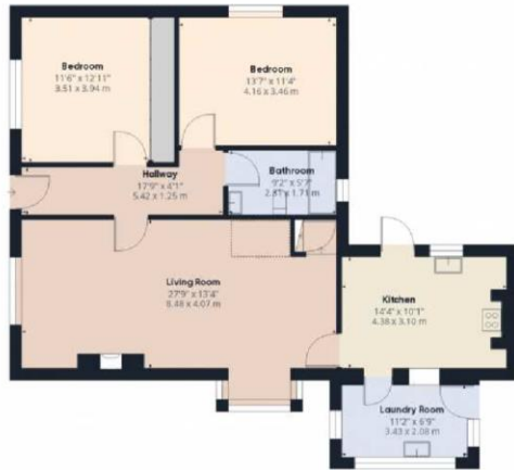
Floor 0 Building 1