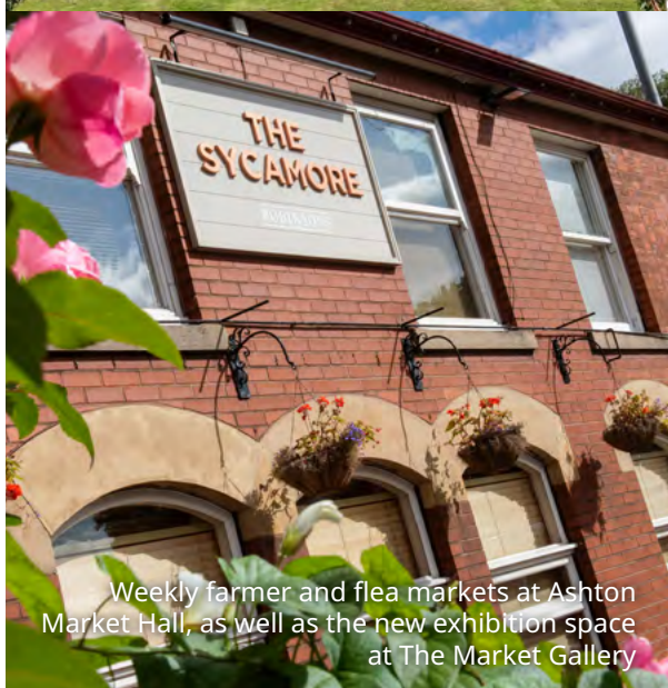
Weekly farmer and flea markets at Ashton Market Hall, as well as the new exhibition space at The Market Gallery

There are a range of activities to enjoy in Ashton-under-Lyne, with Stamford Park, Ashton Market, and Daisy Nook Country Park all close to home. In town, you'll also find galleries, museums, shops and a choice of great local places to grab a drink or a bite to eat. Manchester is just 40 minutes away by car and provides a huge choice of entertainment options for the entire family.