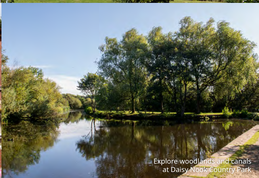
Explore woodlands and canals at Daisy Nook Country Park