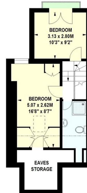
Second Floor 359 sq ft

Chesterton Global Ltd trading as Chestertons for themselves and for the vendor of this property whose agents they are, give notice that (i) these particulars do not constitute any part of an offer or contract, (ii) all statements contained within these particulars are made without responsibility on the part of Chestertons or the vendor, (iii) whilst made in good faith, none of the statements contained within these particulars are to be relied upon as a statement or representation of fact, (iv) any intending purchasers must satisfy themselves by inspection or otherwise as to the correctness of each of the statements contained within these particulars, (v) the vendor does not make or give either Chestertons or any person in their employment any authority to make or give representation or warranty whatsoever in relation to this property. Wide angle lenses may be used. ©Copyright Chestertons | Chesterton Global Ltd | Registered Office 40 Connaught Street, Hyde Park, London W2 2AB Registered Company Number 05334580.