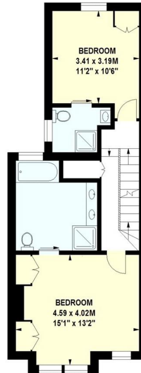
First Floor 543 sq ft