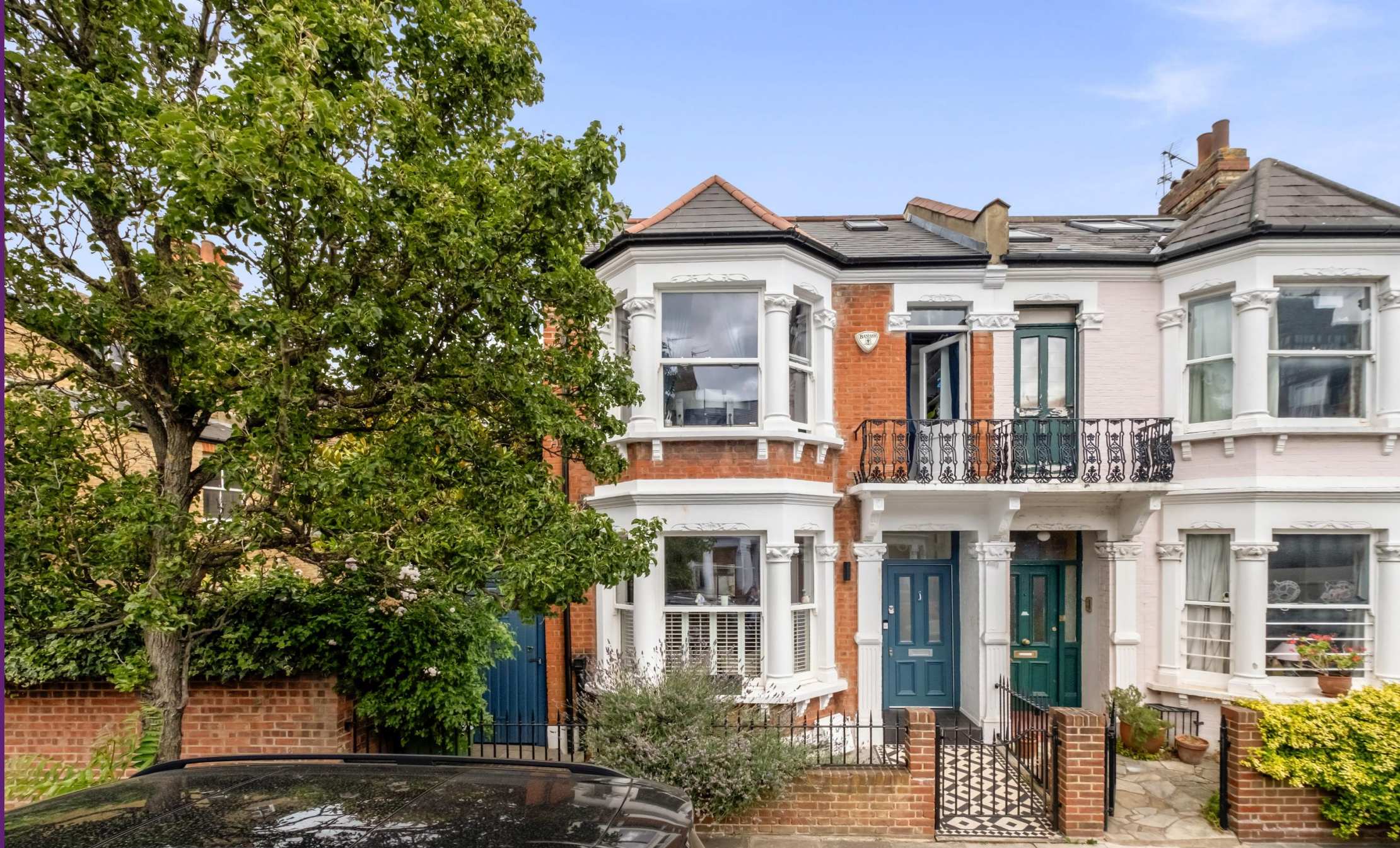
Margravine Gardens Barons Court, W6