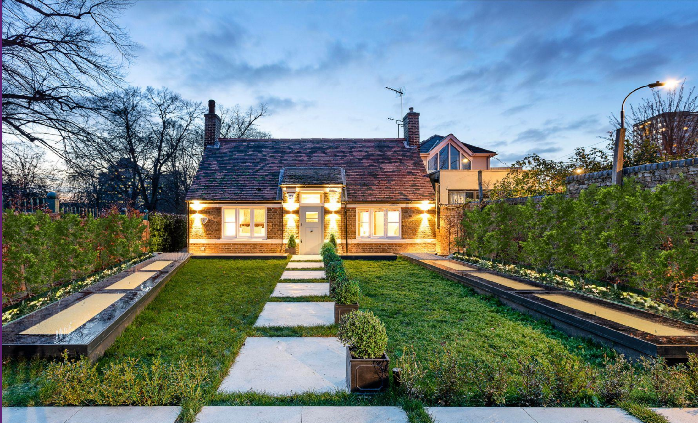
Margravine Gardens Barons Court, W6