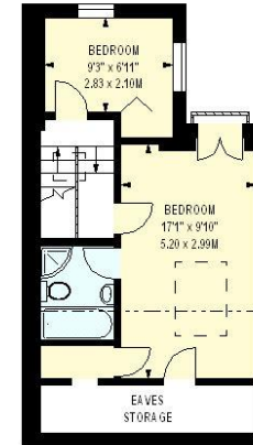
Second Floor 355 sq ft

Illustration For Identification Purposes Only. Not To Scale *Floorplan Drawn According To RICS Guidelines Copyright of FeaturePRO