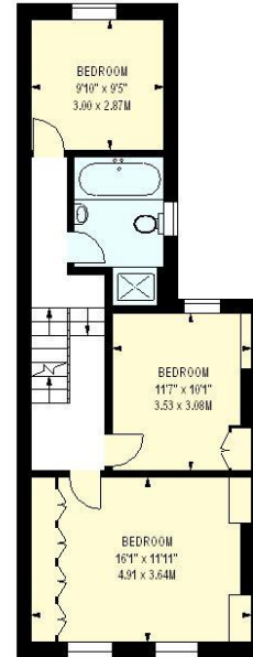
First Floor 590 sq ft