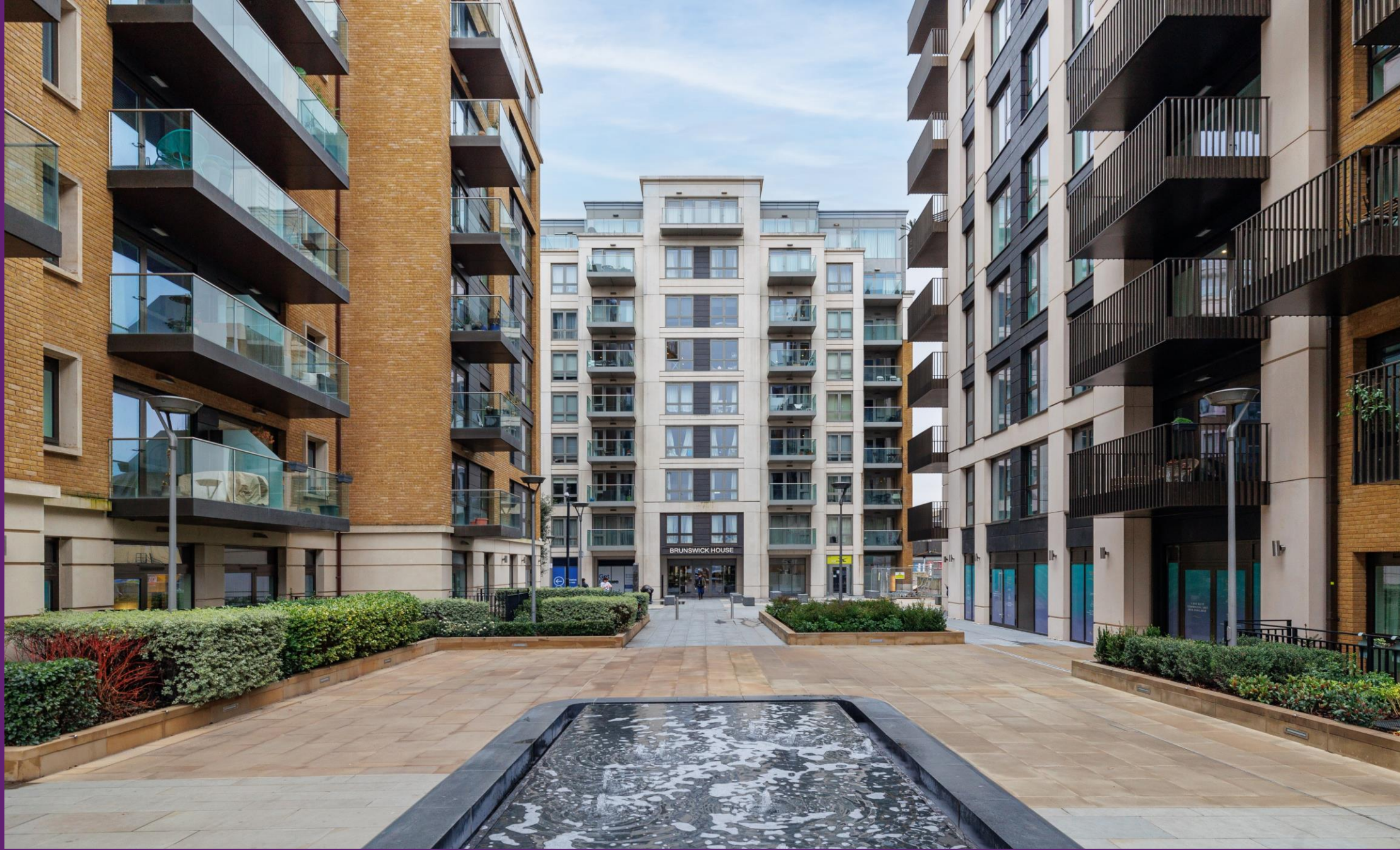
Brunswick House Parr's Way, W6