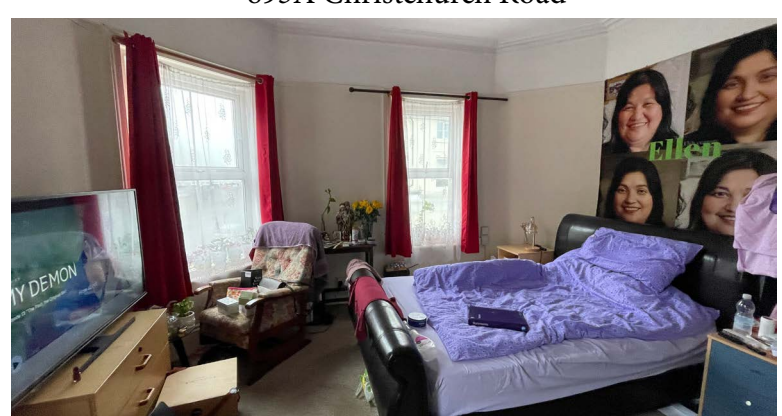
895A Christchurch Road