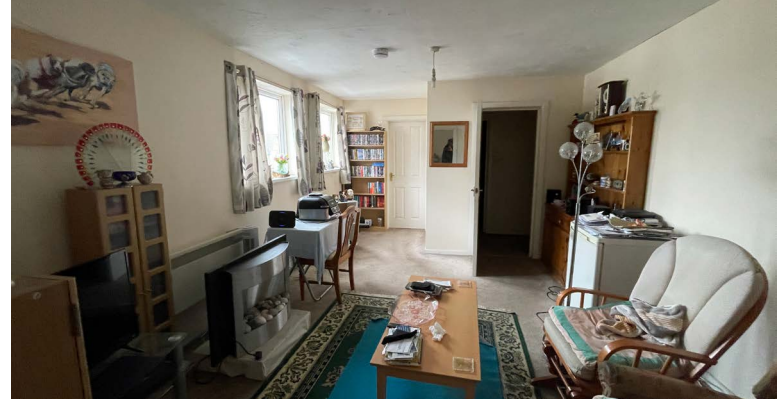
895B Christchurch Road