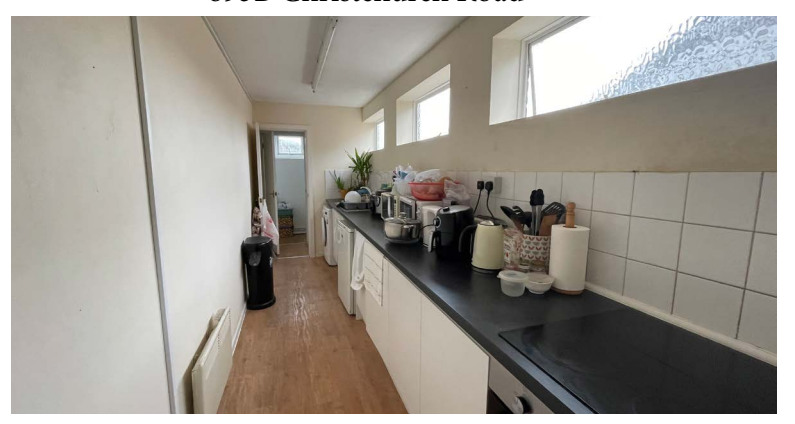
895A Christchurch Road