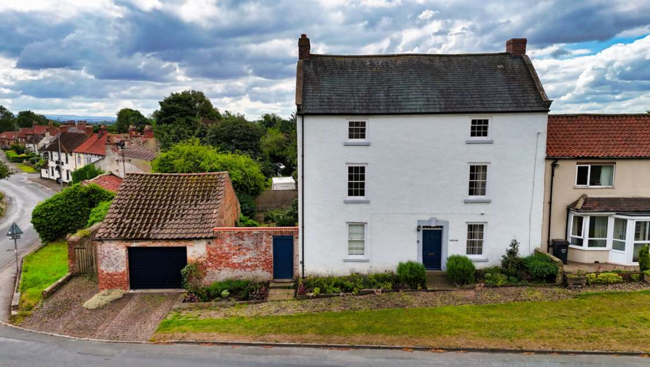
Haughton House North Cowton, DL7 0HG