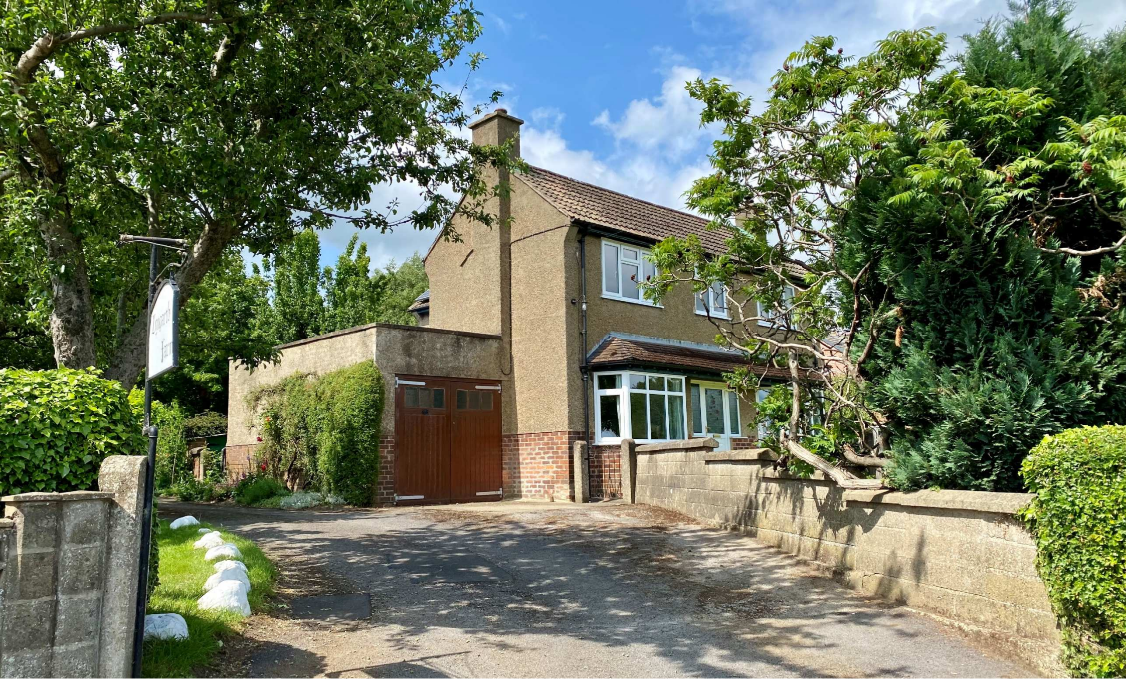
Lyngarth Farm Exelby Road, Bedale, North Yorkshire, DL8 2ER