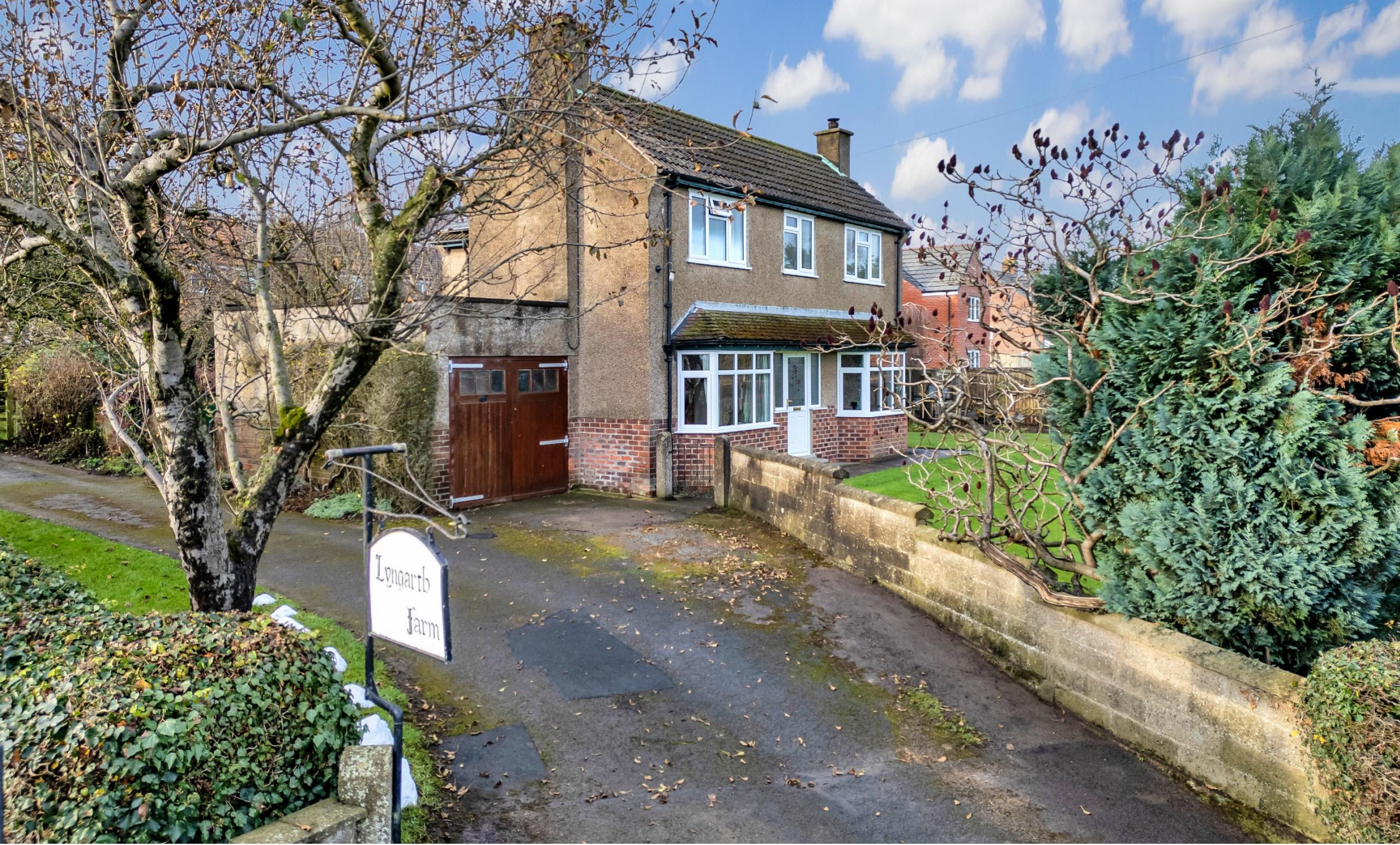
Lyngarth Farm Exelby Road, Bedale, North Yorkshire, DL8 2ER