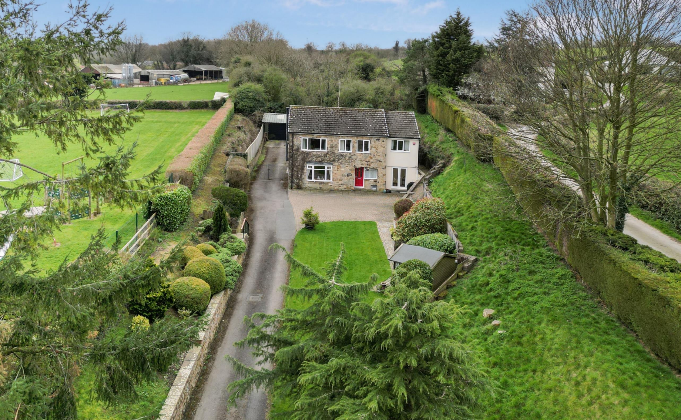
Station Lodge West Tanfield, Ripon