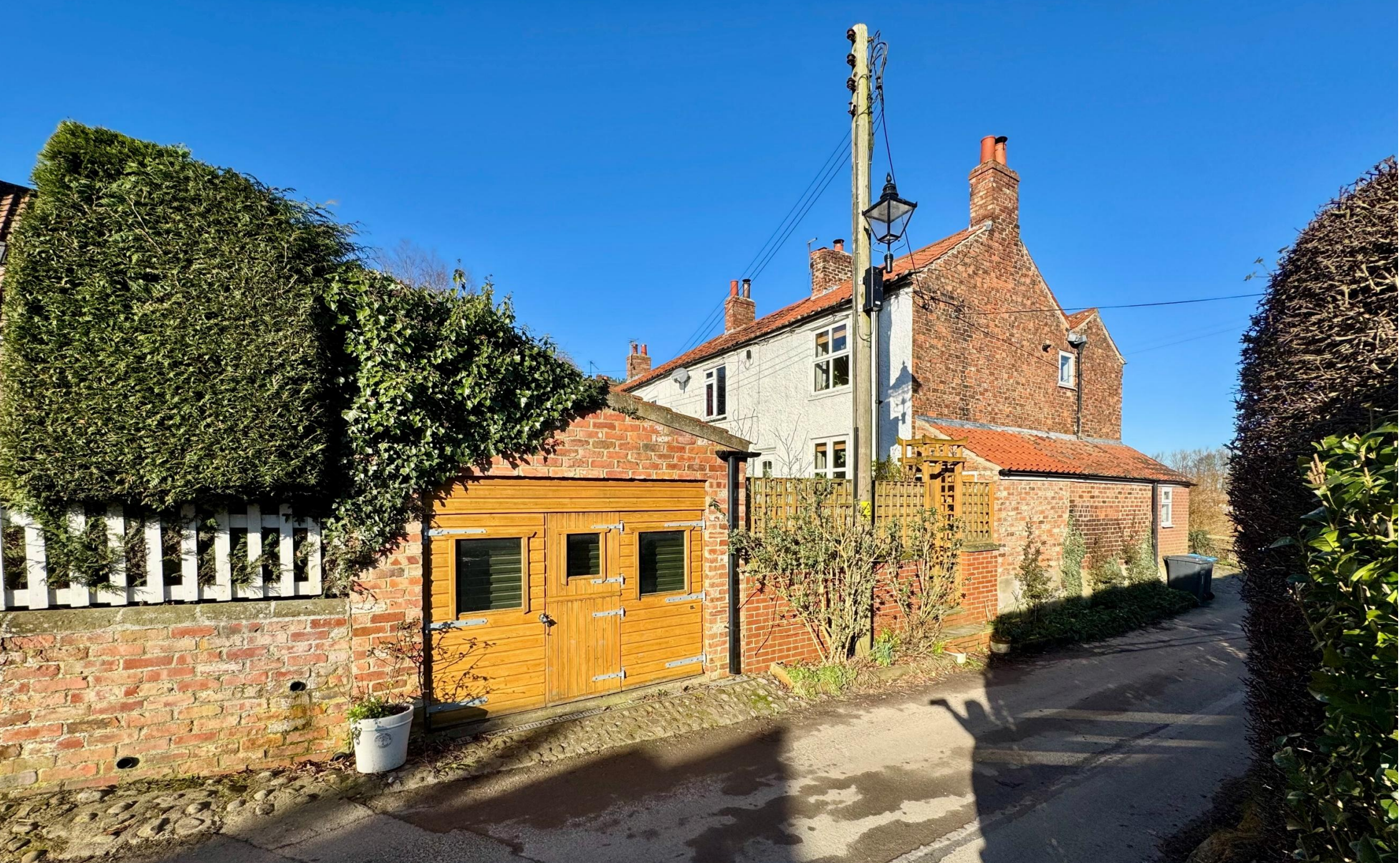
I Railway View Ainderby Steeple, Northallerton, DL7 9QD