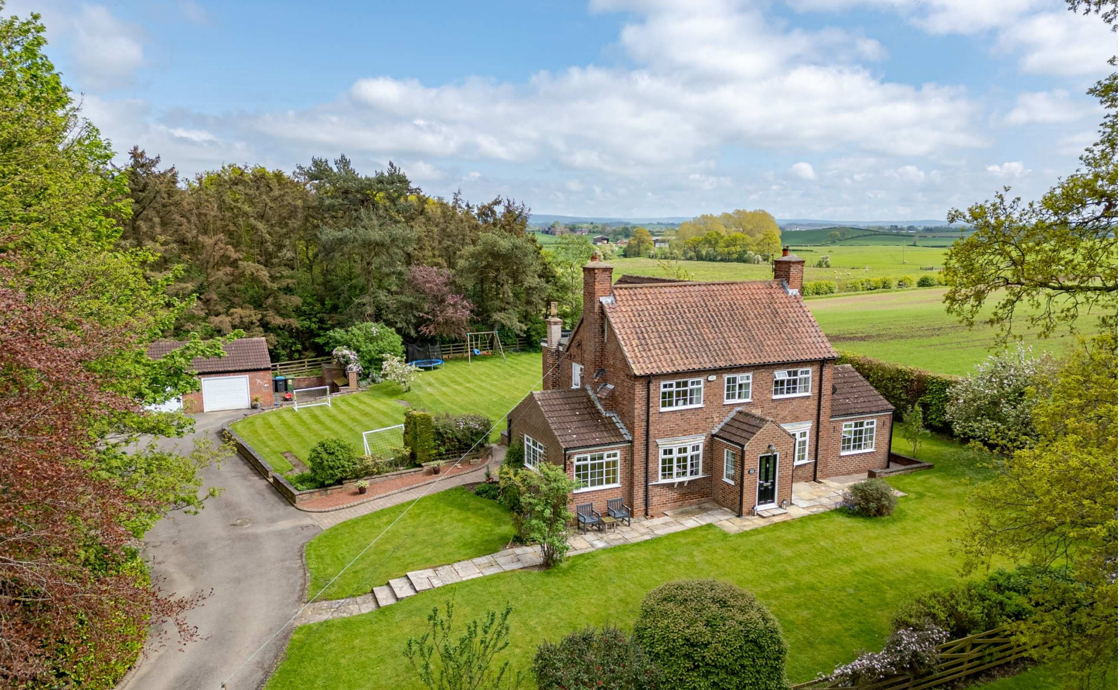
Warren Cottage Yafforth, Northallerton