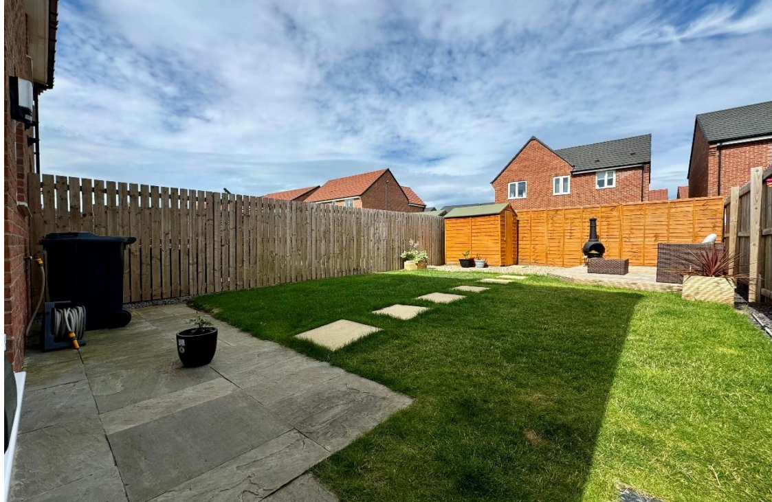
4 North End, Bedale, North Yorkshire, DL8 1AB Tel: 01677 425950 E info@robinjessop.co.uk