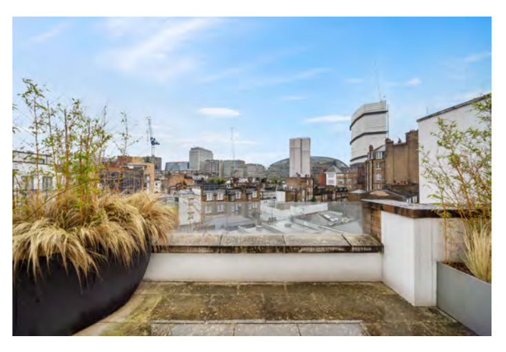
Situated directly opposite Buckingham Palace, The Buckingham apartment sits at the very heart of London's most distinguished address, Buckingham Palace. St James Park offers an array of high end boutiques, restaurants and cafes close by. Additionally, Victoria Station and St James Park are just a short walk away offering convenient access to the wider city.