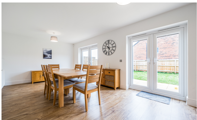
Kitchen/ Dining Room

Carpeted stairs lead you gracefully to the upper floor, promising comfort underfoot as you make your way to the private quarters of the home. To your left, the living room beckons with its inviting atmosphere. This spacious room is perfect for unwinding after a long day or hosting intimate gatherings with friends and family. Double glazed window to front aspect, bringing in lots of natural light with laminate flooring.