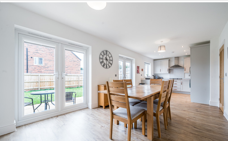
Kitchen/ Dining Room