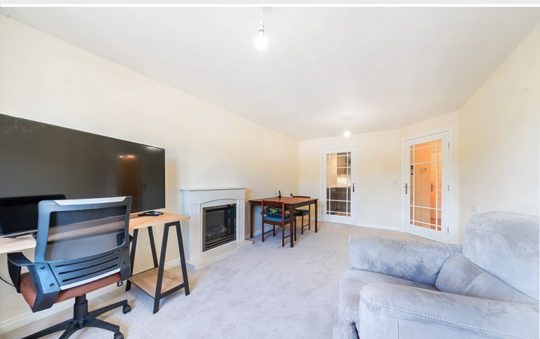
Living/ Dining Room

The spacious living/dining room is where you can unwind with a good book or host family and friends for a cosy gathering. The open layout provides flexibility in arranging your furniture, allowing you to personalise the space to your taste. Electric fire and surround. Double glazed window to rear aspect, bringing in lots of natural light while providing views of the Beacon in the distance. Carpet flooring