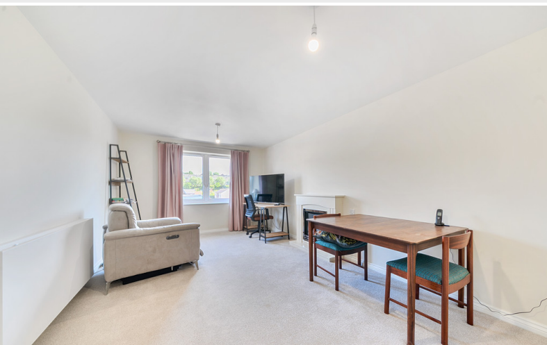
Living/ Dining Room