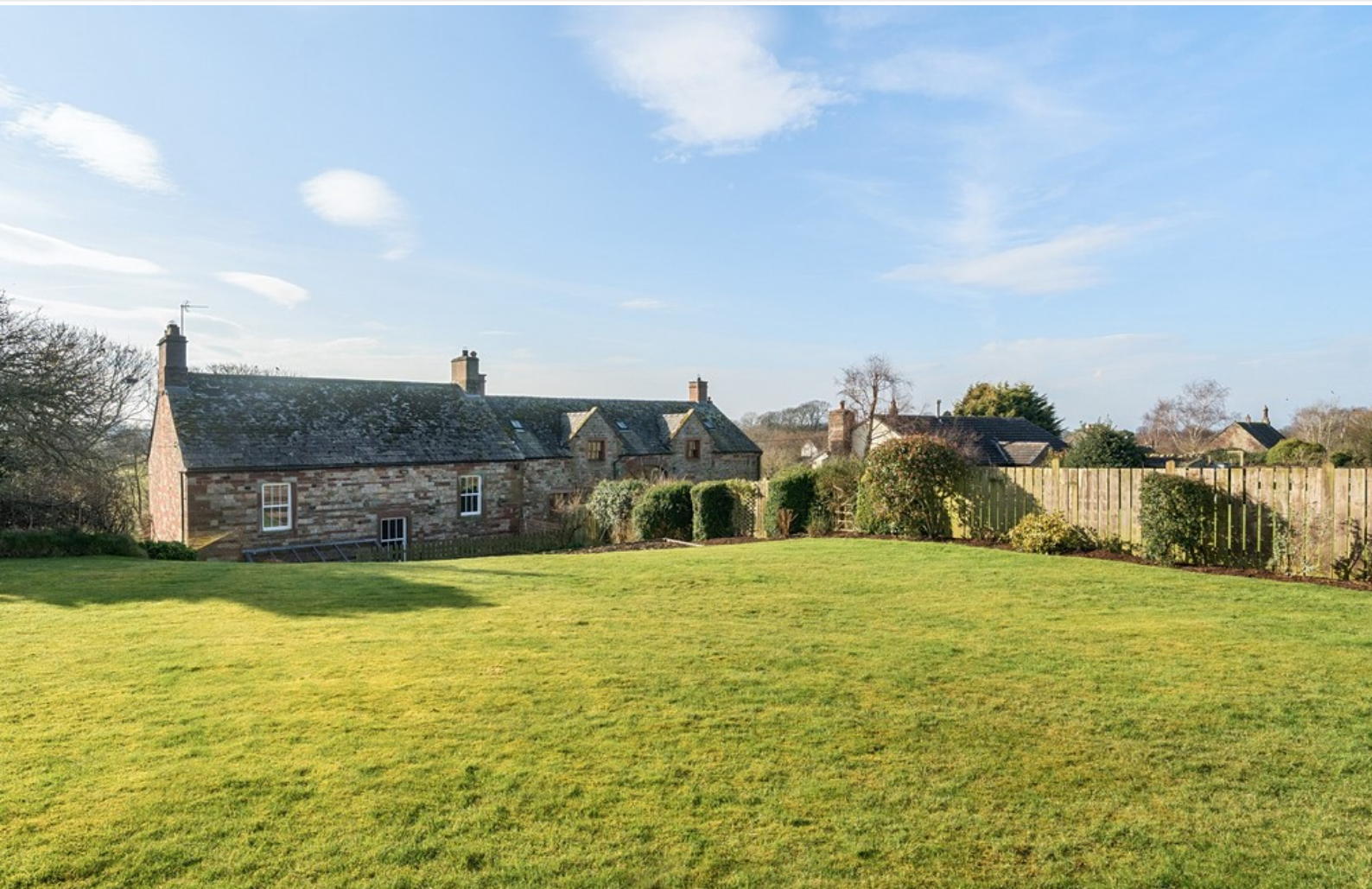
Rear Aspect and Garden