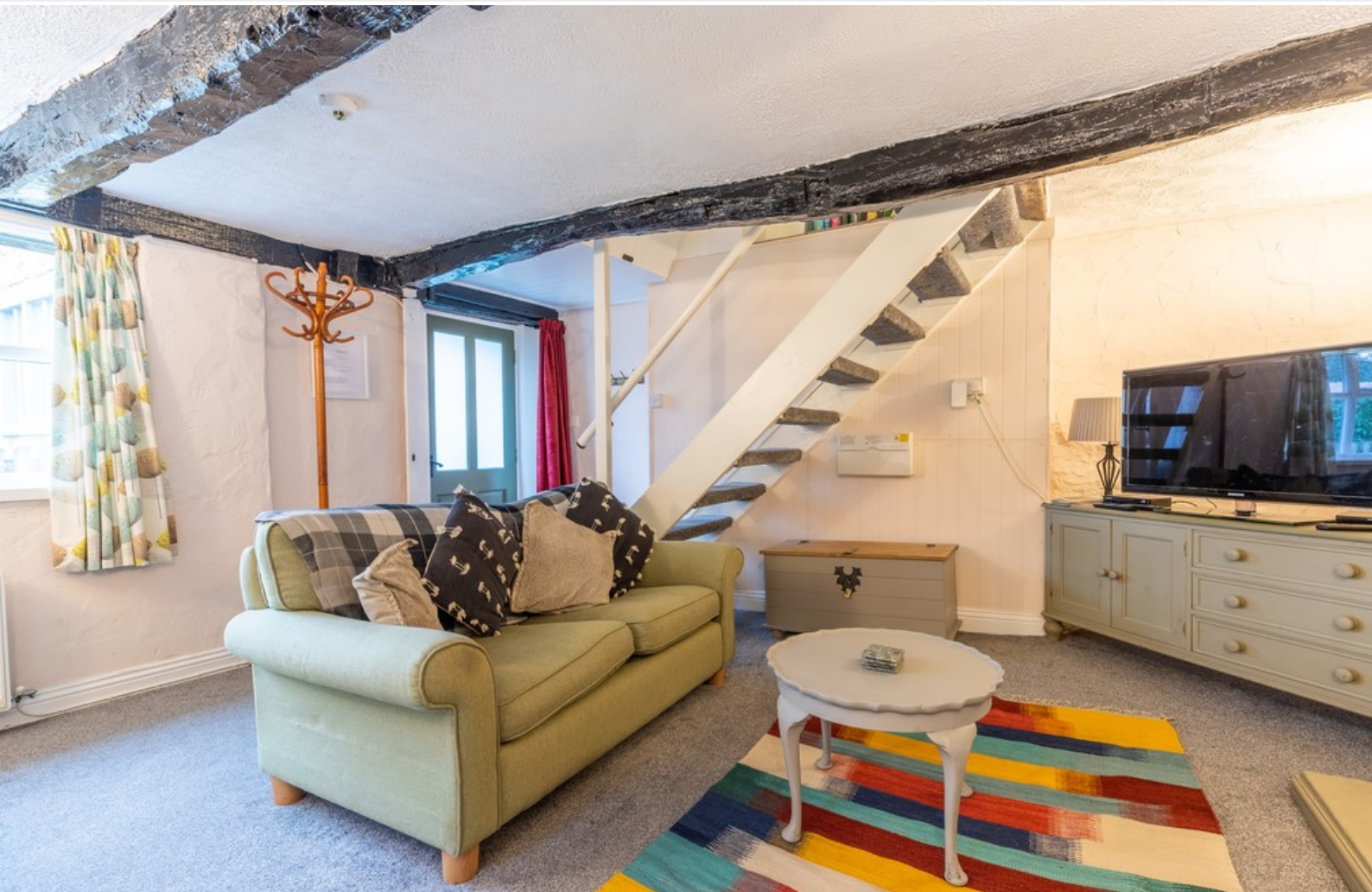
Annexe Living Room